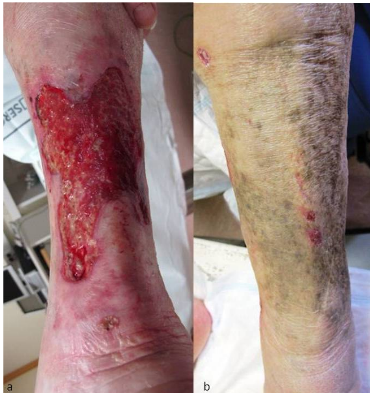
Figure 1. (a) Large ulcers on lower legs surrounded by erythema and purpura (b) Ulcerations almost healed following therapy with intravenous sodium thiosulfate.

Patient 1: a 73-year-old woman presented with a 2-month history of painful and necrotic ulcers surrounded by retiform purpura on her lower legs (Figure 1a). Her medical history included diabetes mellitus type II, hypertension, obesity, lupus erythematosus (treated with antimalarial drugs and systemic corticosteroids), HCV infection, chronic kidney disease, atrial fibrillation (treated with acenocoumarol), and cardiac valve disease. Plain radiographs of her legs identified vascular