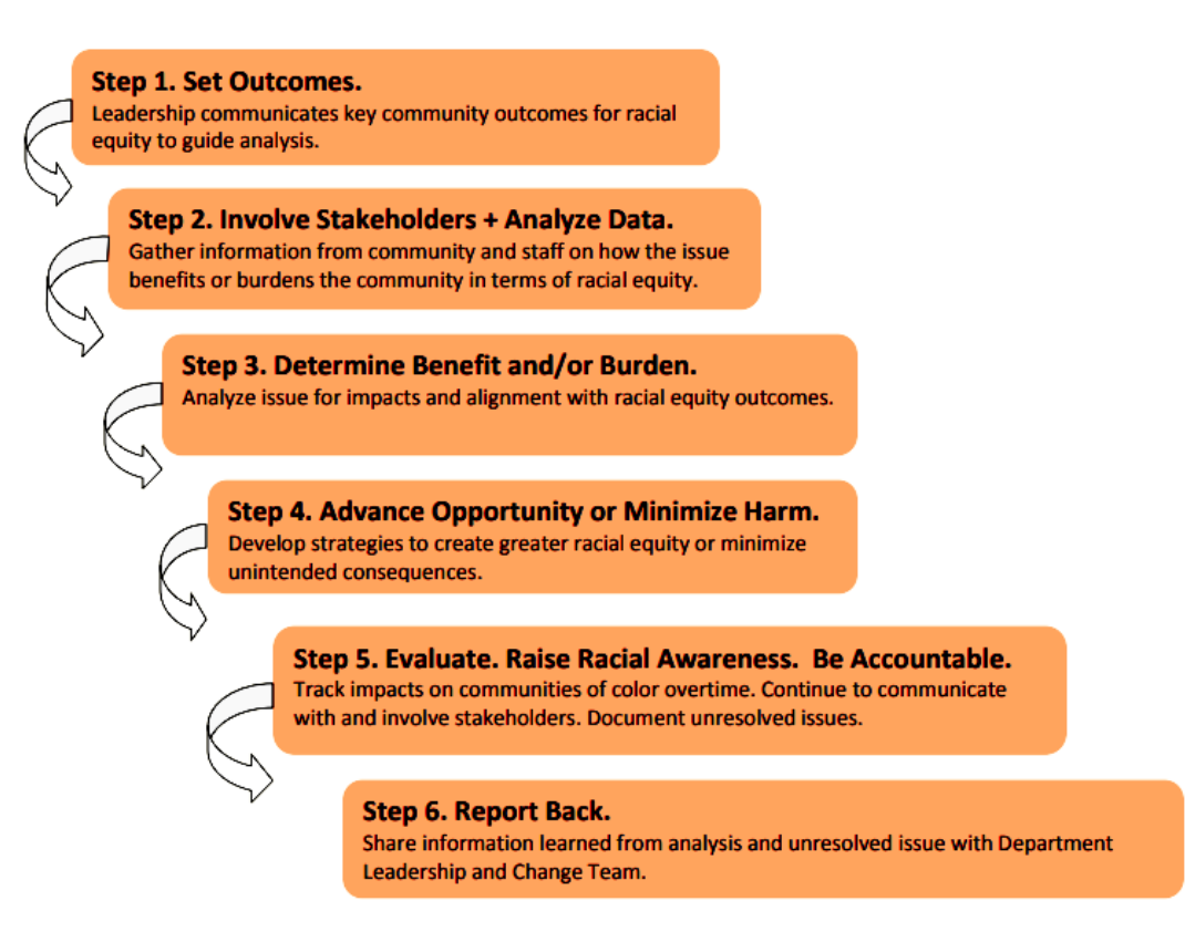
Figure 1. City of Seattle's process to assess equity impacts using their Racial Equity Toolkit

Seattle has proposed evaluating the following discounts for its CP program to ensure equity for low-income households: