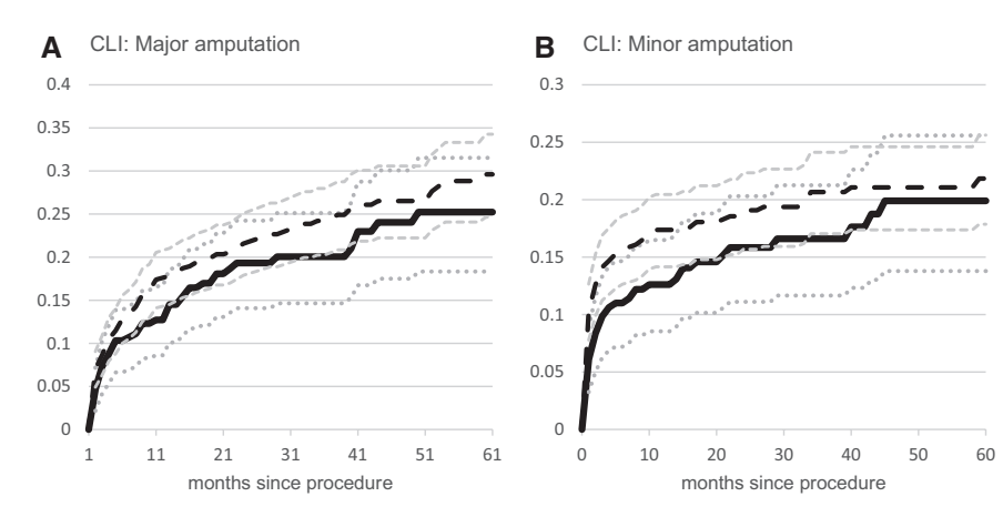
Figure 2. Cumulative incidence by indication and procedure type. Peripheral endovascular intervention, solid line (95% Cl dotted lines); lower extremity bypass, long dashed lines (95% Cl smaller dashed lines); and unadjusted cumulative incidence using Kaplan Meier survival models. Cl indicates confidence interval; and CLI, chronic limb ischemia.

effectiveness study, patients were not randomly assigned to LEB or PVI. The decision to choose 1 approach versus the other may be related to unmeasured factors associated with the clinical outcomes. To reduce potential confounding by indication bias we used 2 different propensity methods to balance the covariates among patients undergoing the 2 revascularization strategies. We found comparable results by using IPTW and matched propensity score analyses. The matched analyses estimated treatment differences selecting patients with characteristics of those who received the less common treatment (LEB for patients with claudication and PVI for patients with CLI). In contrast, the IPTW models aimed to estimate treatment effects for a full population. The similar results imply that patterns seen in this study did not depend on the patient