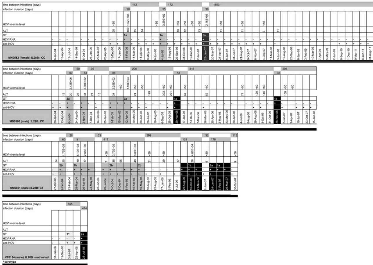
Figure 2. Event timelines for reinfection cases (A), intercalation cases (B), and an unclassified case (C) with multiple genotypes. A, Hepatitis C virus (HCV) viremia (IU/mL), alanine aminotransferase (ALT), genotype (GT), HCV RNA, and anti-HCV results showing acute HCV infection, reinfection, and reclearance among young injection drug users (IDUs) who have previously cleared HCV infection. Visit dates are shown in the lower boxes. Gray boxes show new acute HCV infections and black boxes show reinfections. Participants whose first infection serology was consistent with that of previously resolved infection (anti-HCV positive and HCV RNA negative) are shown in scored boxes. ^ in the GT box indicates that GT was determined by serotyping. B, HCV viremia (IU/mL), ALT, GT, HCV RNA, and anti-HCV results showing acute HCV infection and intercalation among young IDUs. Visit dates are shown in the lower boxes. Light gray boxes show new acute HCV infections and intercalations. Participants whose first infection serology was consistent with that of previously resolved infection (anti-HCV positive and HCV RNA negative) are shown with scored boxes. ^ in the GT box indicates that GT was determined by serotyping. C, HCV viremia (IU/mL), ALT, GT, HCV RNA, and anti-HCV results in a young IDU whose infection could not be classified as either reinfection or intercalation. Results show acute HCV infection and either coinfection or superinfection. Visit dates are shown in the lower boxes. Lighter gray boxes show new acute HCV infection and darker gray box shows infection with a different genotype. Abbreviations: ALT, alanine aminotransferase; GT, genotype; HCV, hepatitis C virus; IL28B, interleukin 28B.

may also be due to sensitive nucleic acid amplification testing for HCV RNA, potentially enabling detection of more low-level viremia events than by quantitative assays with higher limits of RNA detection [34, 35].