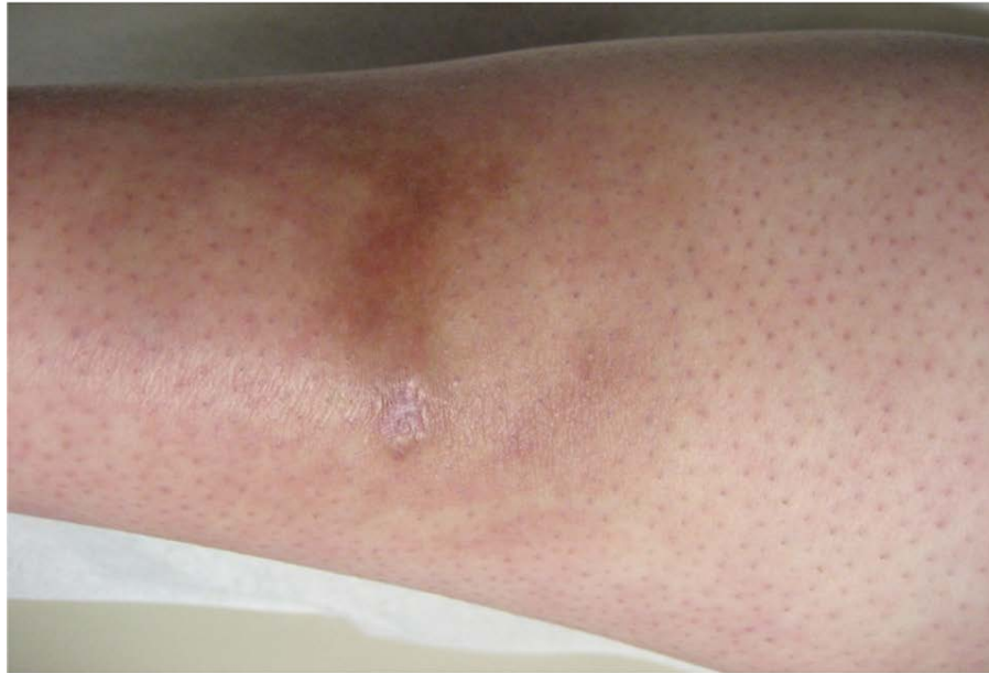
Figure 3. Resolution of the plaque after treatment with certolizumab and methotrexate

In addition to the cutaneous disease, our patient suffered from perianal abscesses and fistulas. The patient had a history of a prior infusion reaction with infliximab and had failed adalimumab combined with methotrexate in the past, and was therefore treated with the pegylated TNF inhibitor, certolizumab, combined with methotrexate. Two weeks after the first infusion, the plaque on the left calf showed marked improvement, with complete resolution at six weeks (Figure 3). Her perianal abscesses resolved and her disease remained controlled in follow up of three years.