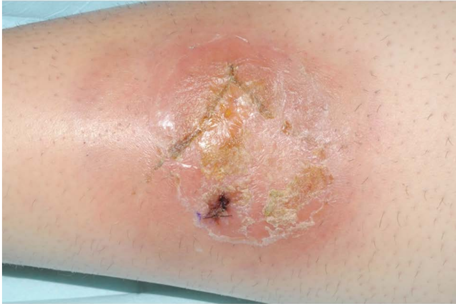
Figure 1. An erythematous plaque of the left calf with central scale and crust

On physical examination, she was afebrile and had a tender indurated erythematous plaque with scale on the left calf (Figure 1). White blood cell count with differential was within normal limits. Sonogram of the left calf revealed mild soft tissue edema. Two skin biopsies were obtained, one for tissue culture and another for hematoxylin-eosin staining (Figure 2). Tissue culture for bacteria, fungi, and atypical mycobacteria was negative.