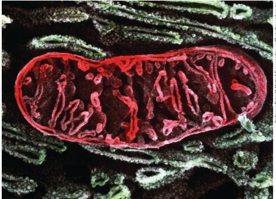
Mitochondria are the organelles in all cells that break down nutrients and produce energy for the body's myriad functions. Nutrition plays a critical role in the process of mitochondriogenesis, and poor nutrition can subsequently lead to health problems.

Aging and many chronic diseases and conditions such as heart disease, diabetes, metabolic syndrome and inflammation are affected by mitochondria, organelles that break down nutrients and produce most of the energy in our cells. These organelles act as the cell's chief metabolic control center, converting substances from the foods we eat into energy for essential functions. To generate the adenosine triphosphate (ATP) that powers most of the chemical reactions in cells, mitochondria use oxygen to help break down (metabolize) glucose, amino acids and fatty acids. Because this process requires oxygen, it is called cellular respiration. The control of oxygen use and respiration is central to normal growth and development, affecting virtually all aspects of the metabolism of glucose, amino acids and fatty acids and the modulation of reactive oxygen species (ROS) that can damage cells (Lane 2006).