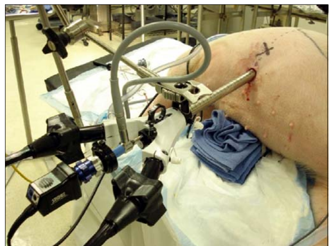
FIG. 2. Basic operative setup of the Single Port Instrument Delivery Extended Reach (SPIDER) surgical system. The surgical system is inserted through the right lower quadrant of the swine and faces the target area. The SPIDER platform is locked in position by using the docking ball. The swine is in the left lateral position.

Three right and two left nephrectomies were performed without any incidence. The mean time to set up the SPIDER platform was 3.5 minutes without any complications associated with the insertion. The mean operative time for right and left nephrectomy was 45.4 minutes