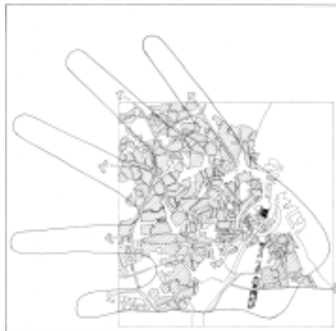
Copenhagen in the palm of a hand that has grown a web between the base of its fingers. Ørestad and Frederikstad in relation to the larger city and to the 1947 finger plan.

An imaginary future visitor to Copenhagen will in all likelihood make the similar observations after a visit to Ørestad. The connections of Ørestad to historic Copenhagen and to Amanger will take a long time to resolve. The emerging form of Ørestad has the appearance of a simple diagram drawn on paper. On first glance, Ørestad is a 500-meter-wide and 5-kilometer long city shaped by Copenhagen's new Metro that starts at the southern end of Ørestad, west of Amanger, and runs in a straight line for much of the 5 kilometers along elevated tracks towards Ørestad's northern end near Islands Brygge. Here the Metro submerges under the historic city.