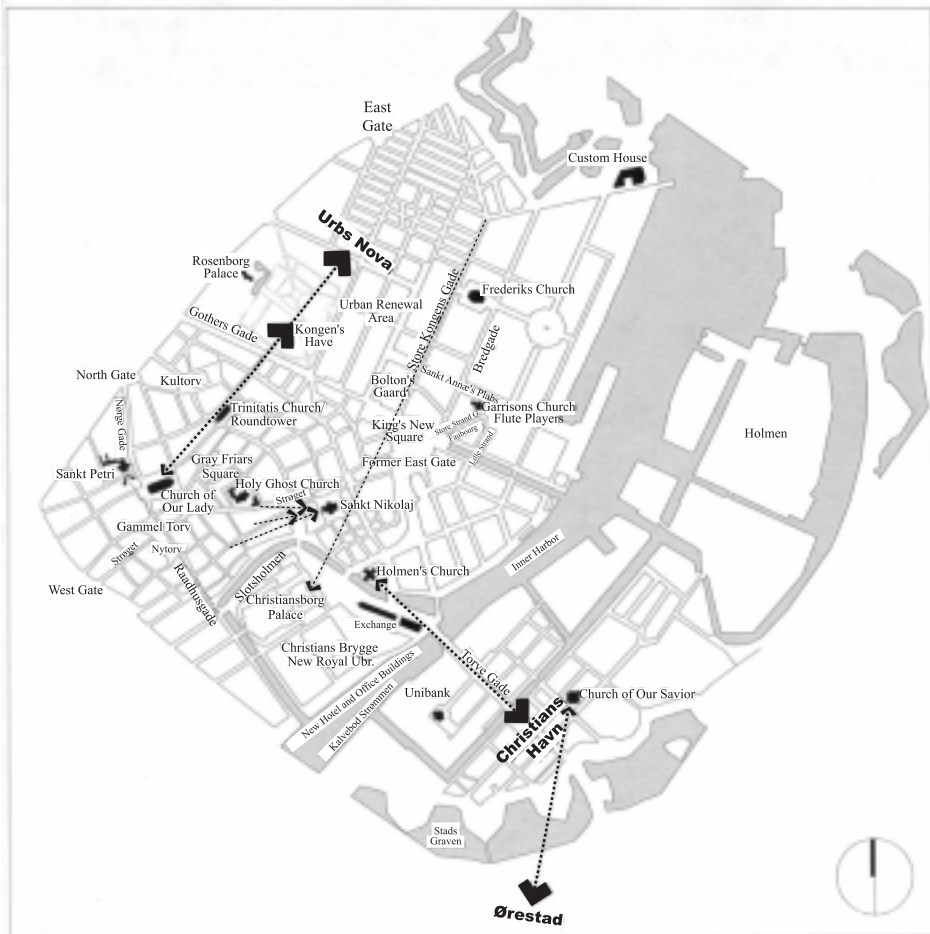
Map of Central Copenhagen

All major transformations and expansions of Copenhagen followed significant changes in society; at all times there was good reason to make a clear break with the old and to say, “We can no longer use the old urban pattern.” But none of the transformations and expansions happened as quickly as they might have been anticipated. Over time, the “old” asserted itself over the “new.” New additions have grown together with greater harmony than in many cities of similar size and stature. The lessons I learned from my walks through the city were that really big mistakes in the layout of new streets are almost impossible to correct, and that the edges of the urban fabric, where new meets old, require major design consideration for a very long time. Most importantly, it appeared to me that the people of Copenhagen are never afraid to change a course of action when it becomes obvious that a better way of doing things has been discovered. This conclusion made me optimistic about people’s ability to re-evaluate the complex forces that bring change to the city. If my optimism is justified, then even major new developments like Ørestad can be linked to historic Copenhagen in a positive manner and the City can define itself anew at an age of global change. Marshall Berman’s thoughts on modern cities came to my mind: “The contemporary desire for a city that is openly