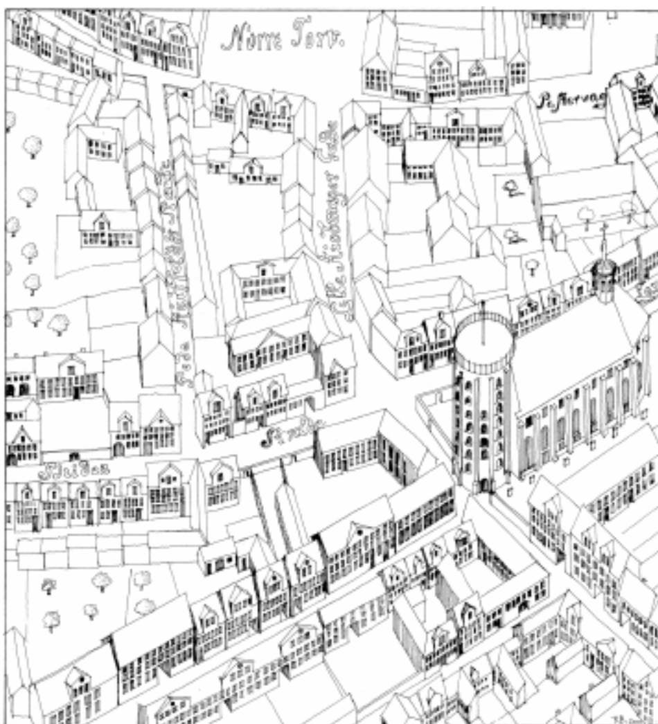
Christian Gedde's 1761 Map of Copenhagen (detail), redrawn

especially if the neighbor on the other side of the street reaps the benefit of that transaction. The town people of Copenhagen kept many of their curving streets. Judging from the map, the ratio of street space to buildable space changed from 15% to nearly 30% in favor of street space. Rebuilding went slowly, but the pace accelerated when the requirement to build with masonry was temporarily lifted. Also, property owners seem to have used the buildable area more intensively. A map from 1761, prepared by the military engineer Christian Gedde 1 and fashioned after Turgot's famous 1731 bird's-eye view over Paris, showed most properties rebuilt to a three- to four-story height. All buildings were depicted with strikingly similar building façades, which made me suspect that Gedde used symbols rather than reality as a guide. However, the unified appearance of new construction was apparently a concern; the Crown's chief architect, Johan Cornelius Krieger had prepared a building typology complete with elaborate façade drawings. Although the new buildings were more modestly executed, the so-called 'Fire Houses' gen-