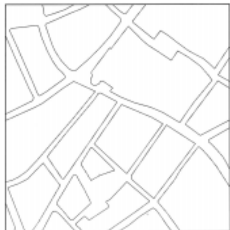
1730 Detail of the Fire Damaged Area — Street Widening Proposal