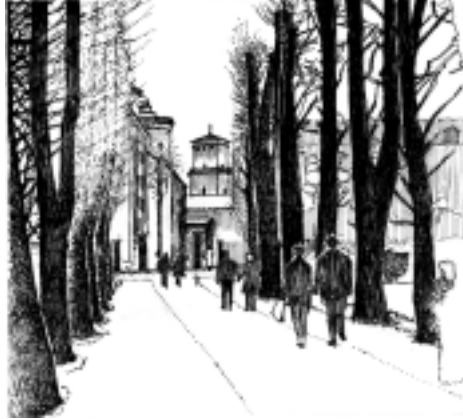
Ladies Walk — Kongens Have

As someone who has been familiar with Copenhagen for 30 years, I observed an apparent discord between the various new projects and the existing spatial patterns of the inner city. I took my winter walks through the old parts of Copenhagen, intending to learn first-hand about the city throughout history. I wanted to discover those traces of historic transformations that are still visible. Through the process of walking and observing, I hoped to discover principles that might be brought to bear on how current city transformations and expansions could be directed.