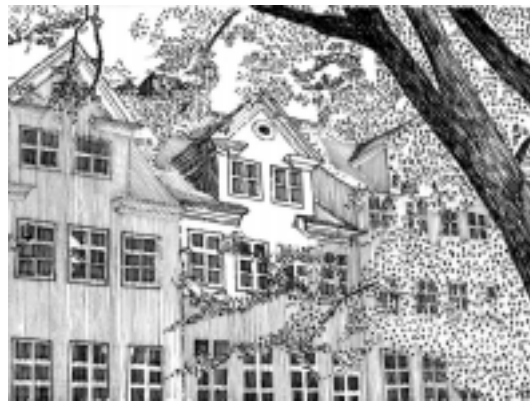
Gray Friars Square, Rebuilding Copenhagen after the 1728 Fire

Looking at some of the edges between old and new, I came across an interesting, battered map from 1730 depicting the proposed street widening after the great fire of 1728 (Lorenzen 1942). Fanned initially by strong northwesterly winds, the fire started on Wednesday evening, October 20, burned until Saturday, and destroyed the entire northern half of the city. The map is interesting because it shows Copenhagen’s medieval street grid as it existed prior to the fire. To improve circulation and to prevent future fires from spreading across narrow lanes, a street-widening program was proposed by the authorities. Furthermore, masonry construction was made mandatory instead of the traditional half-timbered building method. The owners of properties were required to start the rebuilding on new stone foundations leaving a street width of not less than 20 alen (12.5m) and 24 alen (15m) on more important streets. The map shows how such requirements defined future property lines after more than doubling the width of many streets.