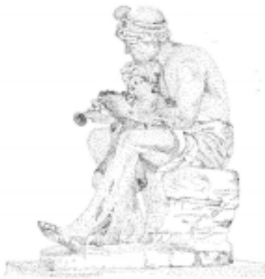
The Flute Players

When compared in size, the proposed 21 st century Ørestad covers more than eight times the land area of the 18 th century Frederikstad. From the 1630s, the time when the new city walls were built that made the northeastern city expansion possible, it took over two hundred years to complete Copenhagen's northeastern extension. The real challenges for the design of Frederikstad laid in the pre-existing conditions. The Nyboder row houses, of course, were there and followed the older radial geometry. Older still, in all likelihood, were the property rights outside the old East Gate. A faubourg must have existed here since medieval times. Its streets can still be walked today.