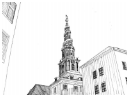
Our Savior's Church, Christianshavn

One can easily imagine a group of Renaissance “geometers” practicing with their new magnetic compasses and eyeglasses from Italy or Holland, surveying and triangulating the perfect geometry of a new city and the placement of important buildings. The new plan—hypothetical because an original was never found—is reconstructed in the Nissen book. Drawn around the center at Baron Boltens Gaard a second circle of an equal 320 roder in diameter intersected the tower of Heligaands Church. It defined the location of the Rosenberg Palace’s main tower and the guardhouse at Nyboder. A third circle of twice the diameter, 640 roder or 2.4 km, drawn also around the new center at Baron Boltens Gaard, defined the location of the outer defense lines, both on land and the Oresund side. The large circle also defined the location of Christianshavn’s main square and cut with stunning precision through the tower of Vor Frelsers Kirke, the Church of Our Savior. I had