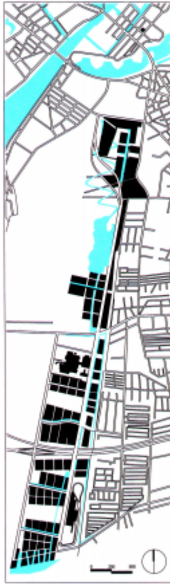
The Linear City. Plan view of Ørestad.

lined with big buildings that have few entrances. I imagine the square crossed by a pedestrian on a cold and windy winter day; it would seem to take forever. By comparison, Kongens Nytorv also measures approximately 20,000 square meters. But many busses and cars circle around that square. A seemingly large area in the center of 8,200 square meters is dedicated to pedestrian use. The pedestrian area of Copenhagen's Town Hall square measures half the size of Ørestad central plaza.