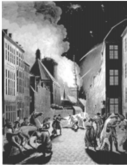
The fire at The Church of Our Lady seen from Landemærket. Watercolor, G. L. Lund after C. W. Eckersberg, 1807

recognizing the building for what it was—the main church of the city. The spire burned in 1728, and the architect Lauritz von Thurah (1709–1759) designed a new baroque spire, which lasted until 1807 when it became a target during the British bombardment. G. L. Lund preserved the view of the tower in flames in a watercolor. The artist depicted the scene along the same view axis that started me on my inquiries into Copenhagen’s city expansions during a walk in Kongens Have.