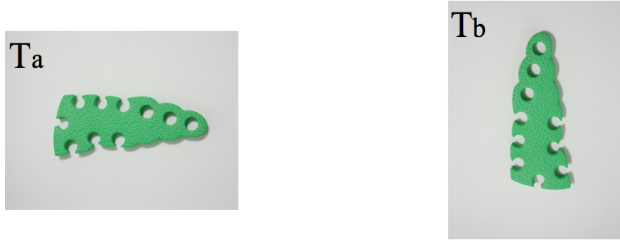
Figure 1. Visually incongruent orientation for instruction: “Take the big green piece and put the holes facing up.”

and communication patterns using two statistical models with distinct goals: (1) predicting communicative success (visual congruence) with lexical convergence and (2) uncovering lexical contribution to localized task failure (visual incongruence). We expected that aligning at the lexical level should contribute to the congruence of the visual workspace across participants, thus resulting in task success. Additionally, we expected that moments of imperfect communication (i.e., miscommunication) should also be uniquely identified within the lexical context. Models were run as a linear mixed-effects model and a mixed logit model, respectively.