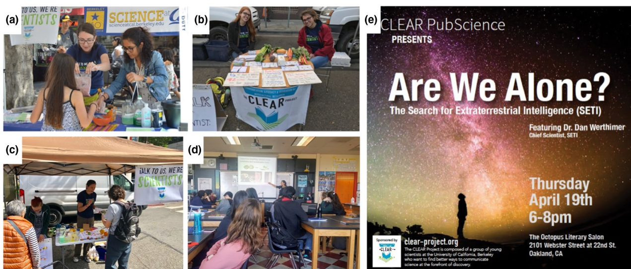
FIGURE 3 CLEAR outreach program. CLEAR members (a) isolating DNA from veggies at Bay Area Science Festival (b) talking about food waste at Downtown Berkeley's Farmers' Market (c) talking about citrus diversity at Downtown Berkeley Farmers' Market (d) teaching in a CRISPR-in-the-Classroom high school class. (e) CLEAR PubScience event featuring a UC Berkeley astrophysicist talking about extraterrestrial intelligence

The overarching goal of CLEAR is to encourage and empower undergraduates, graduate students and postdoctoral fellows to communicate with the public regarding what scientists do and why they do it, with a particular emphasis on plant and microbial biology. Since its inception in 2015, the CLEAR program has attracted increasing numbers of students with interests in engaging with the public. But the largest increase in interest occurred following the 2016 election, when students became especially concerned about the dangers of science denial and