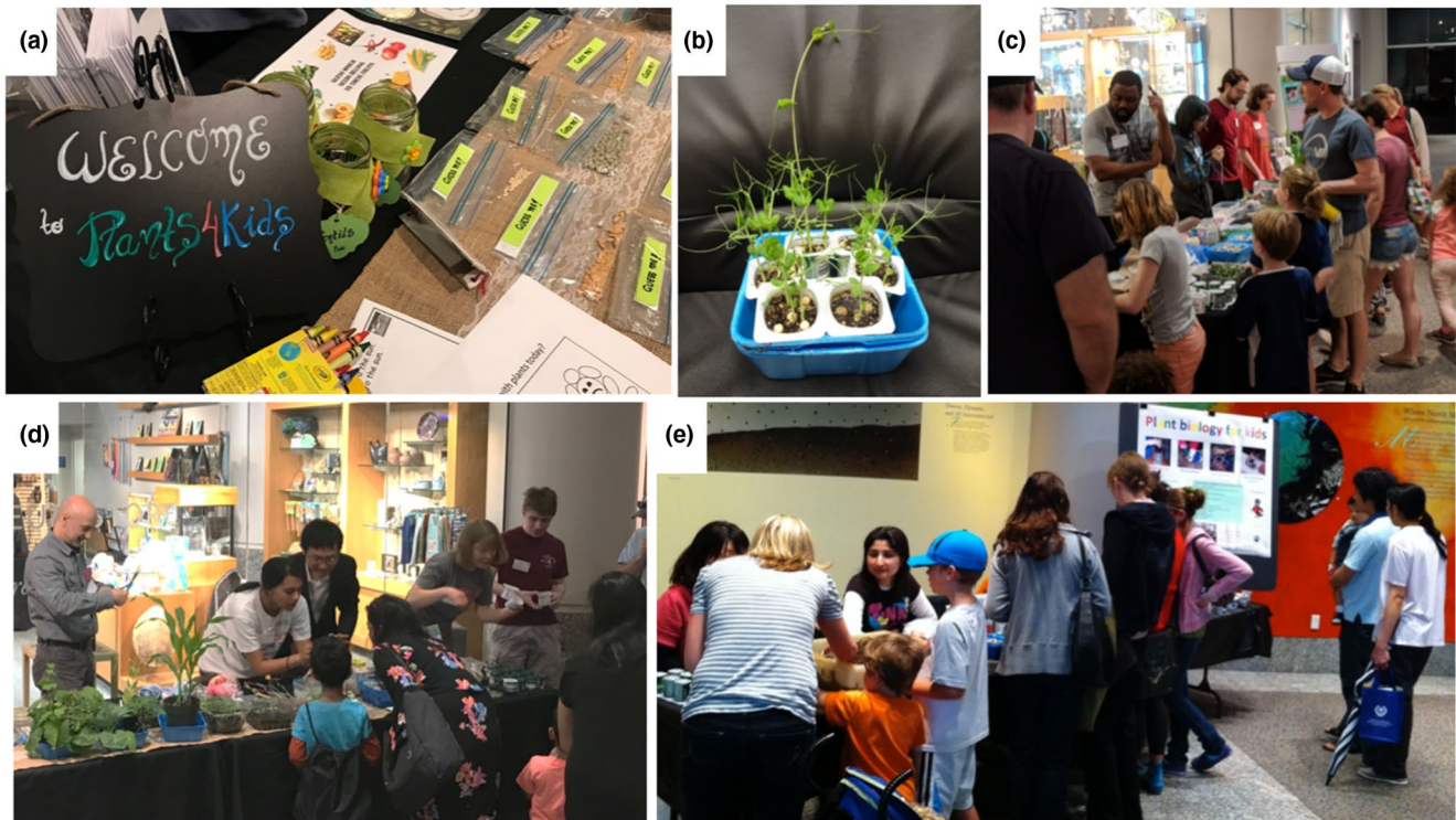
FIGURE 5 Plants4Kids outreach program. Students participating in the “Plants 4 Kids” outreach program in North Carolina. (a) A welcoming sign at a typical Plants4Kids museum demo booth. (b) Three-week-old light-grown pea plants sprouted in recycled yogurt cups: green peas and other legume seeds sold in pound-size bags at most grocery stores are inexpensive and large enough for young kids to handle with ease; museum visitors of all ages plant seeds during hands-on Plants4Kids demos and take the cups home to observe plant germination and growth. (c–e) Representative scenes from a Plants4Kids booth at the North Carolina Museum of Natural Sciences demonstrating active public engagement in the hands-on activities the program provides

(1) Process evaluations are a measure of the performance or completion of steps taken to achieve desired program outcomes (e.g., number of plant science based activity modules completed, number of classes held in a week, the length of lab sessions, etc.). The evaluation can take place throughout the project cycle allowing the assessment of effectiveness at each step and, if warranted, redesign of the program for maximum effectiveness. The process evaluation, if done at every step, requires a significant commitment of personnel time and of financial resources (that many projects lack), thus limiting the feasibility of such evaluation.