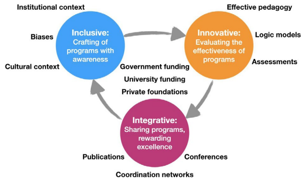
FIGURE 1 Advancing outreach in plant science through Inclusion, Innovation and Integration. Successful outreach programs thrive when a holistic approach is taken. Inclusive programs are crafted with awareness of the demographic, cultural and institutional contexts they exist in. Innovative programs use the state of the art organizational models in their design and devise a means of evaluating their effectiveness through assessments appropriate to their scale. Integrative programs communicate their outreach efforts across labs and institutes to disseminate and share what works. All of these activities need to be supported by an ecosystem of funding from the government, universities and private foundations that recognize excellence across these areas