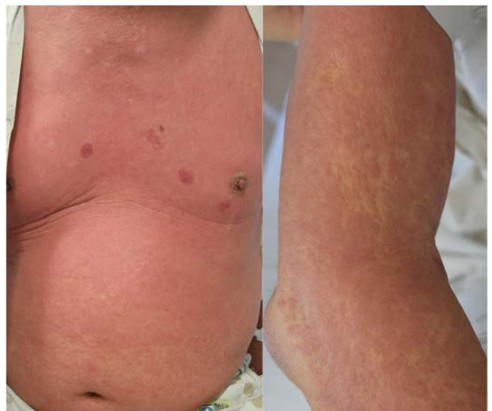
Figure 1. Diffuse infiltrating erythema and plaques were observed over the patient's entire body.

lymphocytes, 13.5%), aspartate aminotransferase, 148U/l (normal, 13-30U/l), alanine aminotransferase 230U/l (normal, 10-42U/l), lactate dehydrogenase 418U/l (normal, 124-222U/l), \gamma -glutamyl transpeptidase 171U/l (normal, 13-64U/l), albumin 3.4g/dl (normal, 4.1-5.1g/dl), blood urea nitrogen 27.7mg/dl (normal, 8.0-20.0mg/dl), blood creatinine 1.07mg/dl (normal, 0.65-1.07mg/dl), serum calcium 13.2mg/dl (normal, 8.8-10.1mg/dl), soluble interleukin-2 receptor 54641U/ml (normal, 121-613U/ml). Anti-human T-cell lymphotropic virus type 1 (HTLV1) antibody testing was positive. The