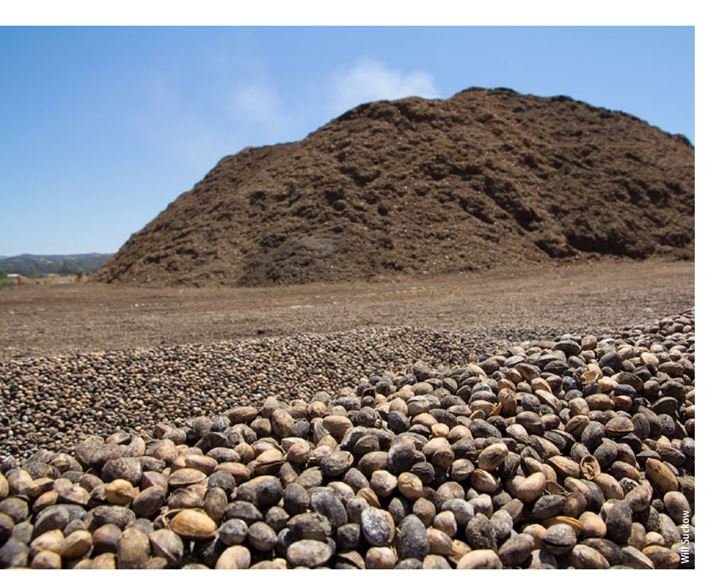
Currently, biomass energy production in California from agricultural residues — such as pistachio shells (foreground) and wood chips (background) - is largely based on the combustion of material from orchards and vineyards. Because biomass-based energy is more expensive than other renewable sources, policy changes or incentives are needed to expand this sector.

across the state may enhance or diminish observable carbon sequestration benefits. Further, it will be important to ensure that rangeland compost application practices do not lead to undesired plant species shifts and do not create negative trade-offs for water quality through nutrient run-off or leaching; it will also be important to track emissions associated with fossil fuel use for transportation and distribution of compost across rangeland sites.