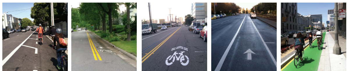
Figure 1. Examples of bicycle infrastructure. From left to right: buffered bicycle lane, contraflow bicycle lane, bicycle route marked by a sharrow, conventional bicycle lane, and a physically separated bicycle lane.

the availability of routes with sharrows increased dramatically between 2009 and 2013, use of these routes did not increase at the same pace, suggesting these facilities were less likely to change route behavior (Figure 2). In contrast, fewer conventional bike lanes were built in the study period, yet bicyclists used these facilities in much greater numbers. This was also the case for buffered bike lanes, even though they made up a substantially smaller portion of the San Francisco bicycle network than sharrows. The remaining innovative bike lanes (i.e., safe-hit posts,