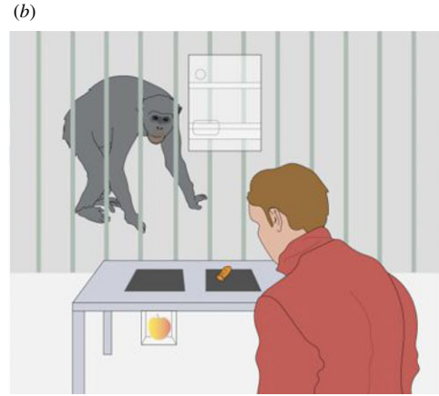
Figure 1. (a) Schematic drawing of the experimental set-up in Experiment 1. Depending on condition, the box containing the apple could either be opened by the experimenter (free choice condition) or not (constrained condition). (b) Experimental set-up in Experiment 2. Note that the box containing the apple is depicted for visualization only. In fact, the experimenter did not have visual access to it (see also electronic supplementary material, figures S3 and S4). In the free choice condition, the experimenter had observed the hiding of the apple. In the ignorant condition, the experimenter was not aware of its availability.

Humans attend to several different variables in their interpretations of social events [18,19]. The most basic dimension is freedom of choice-actions that are freely chosen are evaluated differently from actions that are not. There are two main ways in which agents can be prevented from exercising freedom: constraint and ignorance. In prototypical instances of constraint, an agent is aware of alternative possibilities, but, owing to physical, psychological or social restrictions, is compelled to act in one way. In instances of ignorance, the agent is theoretically free to choose another option, but is not aware that such alternatives exist. Previous work has shown that human adults [20,21], children [22-27] and even preverbal infants [28-30] take freedom of choice into consideration in their assessment of social action. While chimpanzees evaluate various social behaviours that are directed at themselves or others, it is unclear whether the existence of alternative possibilities plays a role in these evaluations. Preliminary evidence that chimpanzees differentiate between voluntary and involuntary actions comes from a study by Call and colleagues ([31], see also [32]), which showed that chimpanzees change their behaviour depending on whether they interact with an 'unwilling' or an 'unable' experimenter.