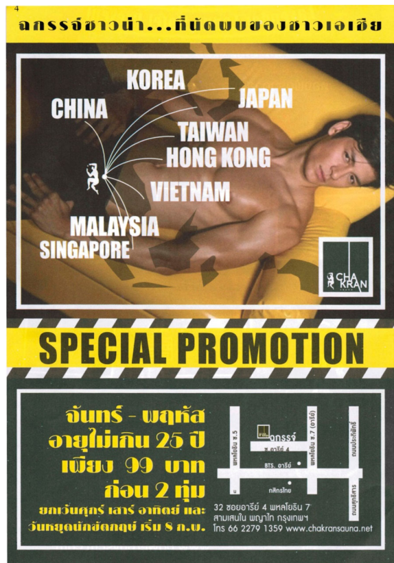
Figure 1. An advertisement for Chakran Sauna, 2009.

that Thai middle-class gay men are trying to make. They are appealing to their existing financial and social capital rather than relying on that of others. Examining intimate partner selection among Thais from different classes sheds light on how Thailand's medial position between developed and developing economies in the region shapes partner preferences.