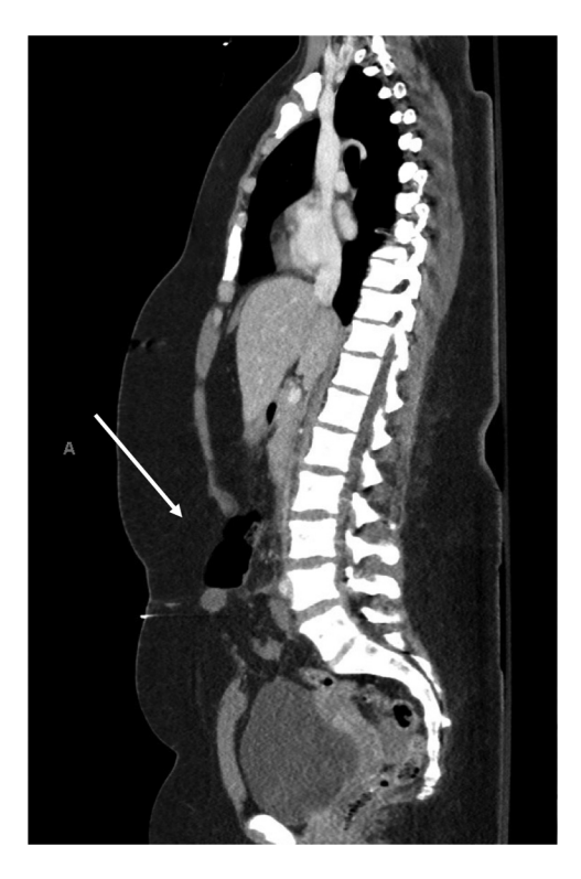
Image 1. Sagittal computed tomography showing rectus muscle disruption with abdominal content herniation (arrow).