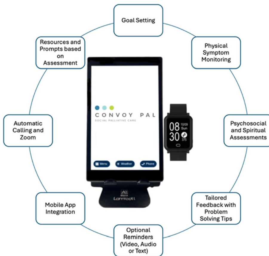
Fig. 2 Convoy-Pal Features

via self-repot weekly, along with smartwatch tracking of steps, heart rate, blood pressure, and skin temperature. Users could review an overview of their symptom reports and smart watch data on the tablet and website dashboard. Each week, users were prompted to complete a different palliative care assessment related to symptoms, advance care planning, spiritual needs, anticipatory grief, health team concerns, and social support. Assessments were specific to the patient or caregiver. Based on user responses, Convoy-Pal replied with a message of encouragement (e.g. it sounds like you have a lot of friends and family to lean on right now) or prompted a credible palliative care resource (e.g. based on your responses, Convoy-Pal can help you connect to supports). For example, if users reported low social support, Convoy-Pal provided resources on finding a support group for social support. If participants reported low satisfaction with their health care team, resources on preparing for visits, asking questions, and improving patient-provider communication were provided. Patients and caregivers shared access to each other’s information dashboard via the system portal and mobile app.