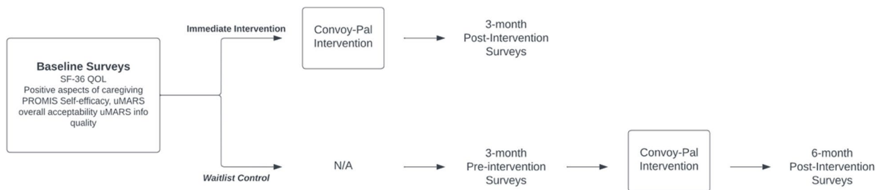
Fig. 1 Convoy-Pal Feasibility Pilot Study Flow

We conducted a single-site waitlist randomized control trial to test the feasibility of the Convoy-Pal intervention (Fig. 1). We selected a waitlist approach to assess the feasibility of implementing the intervention, including