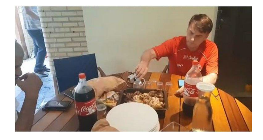
Figure 3: Bolsonaro eating.

History is cyclical. The debate of whether history follows a cycle is not contemporary. Many scholars like Arthur Schlesinger, in Paths to the Present , Arthur Schlesinger Jr, in The Cycles of American History , and Ibn Khaldun, a fourteenth to fifteenth century Arab philosopher, discuss whether historical events are deemed to repeat themselves or if this is some sick joke of fate.<sup>28</sup> I, however, accept the proposition that history is cyclical. I believe that history exists to teach us a lesson, and we, as a society, can only succeed if we learn from the mistakes of the past. If maybe Hitler had paid more attention to Napoleon, he might have succeeded in Russia. Maybe, if we had learned something from the 1918-19 Influenza pandemic, we might have had an easier time with COVID-19.