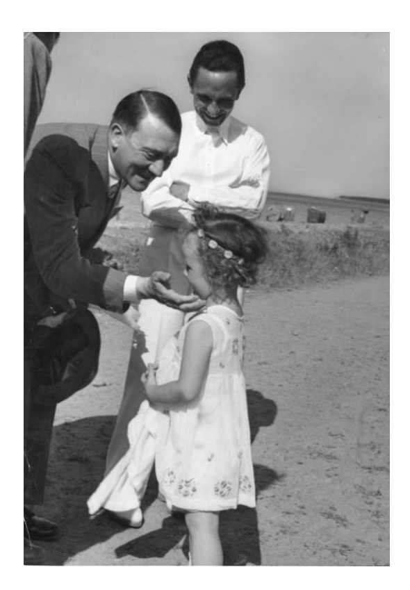
Figure 1: Hitler with Joseph Goebbels' daughter, 1932.

reparations.<sup>6</sup> In response, Germans felt distressed and, due to its demands, hated the Treaty of Versailles. In a situation like this, where people need a savior, is where figures like Hitler appear.