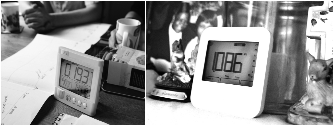
Figure 1. Examples of OWL electricity real-time displays in use by two of our participating households. The device shows real-time and cumulative electricity use (in kW and kWh), time, air temperature and can also show costs and carbon footprint in kg CO 2 equivalent.

It is not simply visual or aesthetic design details that are important. The design of products and services influences how they are used. For example, in a study with a common model of heating controls, Combe et al (2011) found that difficulties in programming them due to interface complexities—including both physical and cognitive issues—could lead to householders using 14.5% more energy than if they had successfully programmed them.