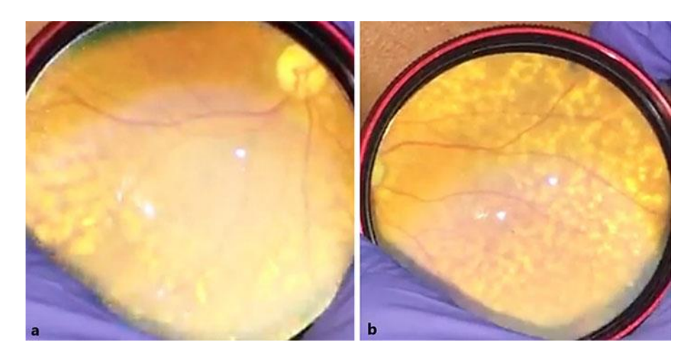
Fig. 3. Dilated fundus examination showed diffuse extramacular drusen of the right eye. The macula was flat. There were no choroidal effusions. a Right eye optic nerve pallor with drusen inferior to the inferior arcade. b More right eye drusen.

Farukhi Ahmed et al.: Acute Onset Ocular Hypotony after Coronary Artery Bypass Surgery