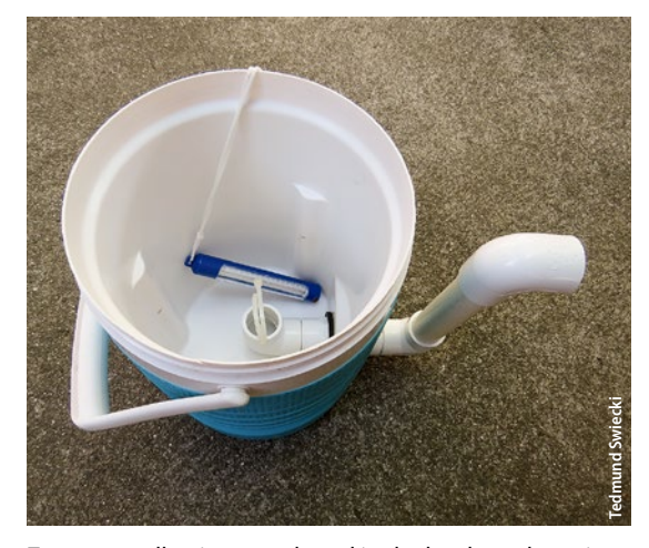
Zoospore collection vessel used in the leachate detection study. The drain is 2.75 inches (7 centimeters) above the bottom; the water outflow (upper pipe elbow outside of vessel) is situated to maintain the water level about 2.5 inches (6 centimeters) below the rim. Vessel depth is 12 inches (30 centimeters). A pool thermometer (shown) or similar can be used to monitor water temperatures during the test.

fills, water drains from the lower-middle portion of it rather than overflowing at the top, which would result in loss of upward-swimming zoospores. The vessel also captures debris, which floats or settles to the bottom of the vessel and may contain sporangia.