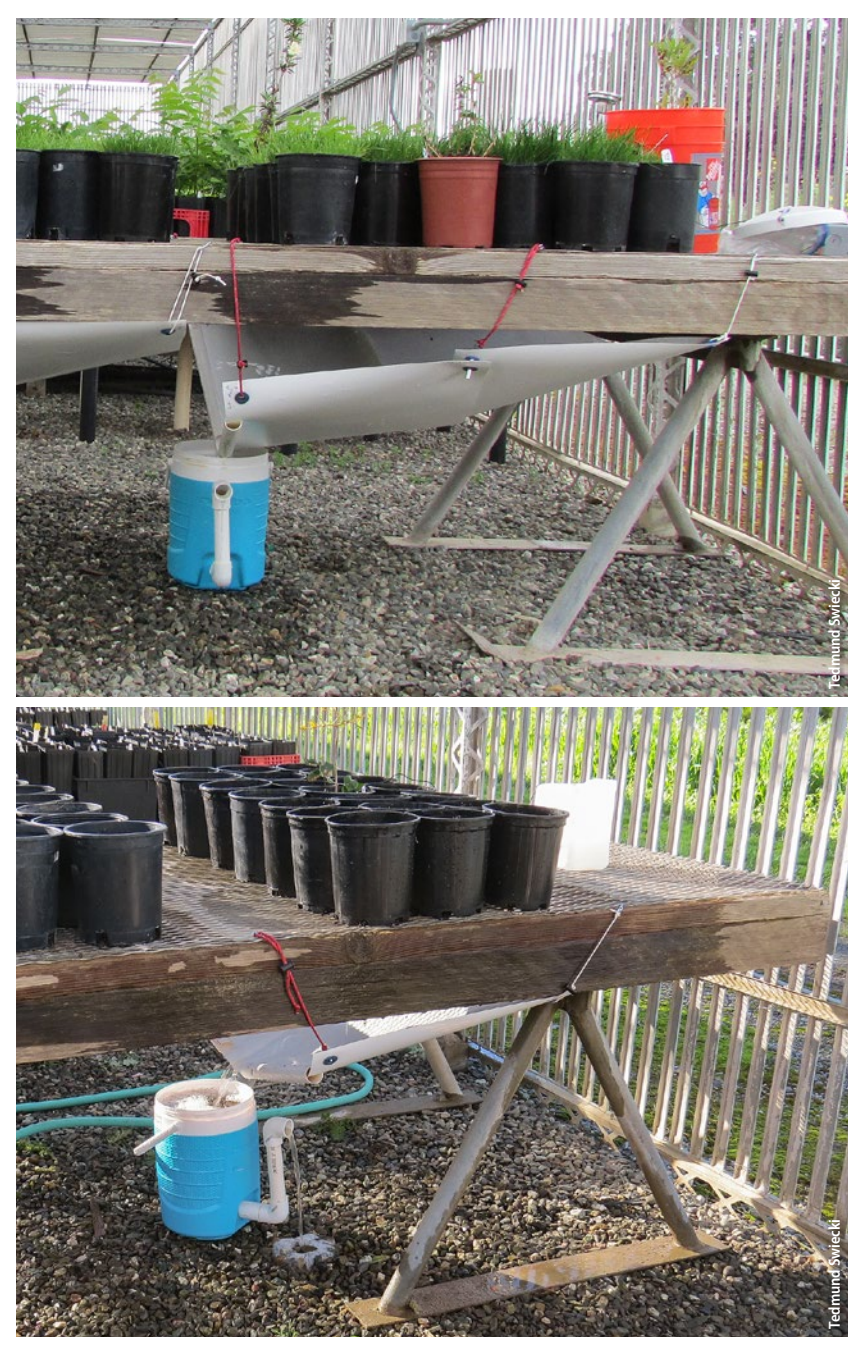
Leachate collection systems and zoospore collection vessels under arrays of 42, top , and 21, bottom , #1 container plants. Each array contains one known Phytophthora -infected plant. Remaining pots are filled with pasteurized potting media (seeded with turfgrass, top ).

Fifteen minutes after the sixth irrigation (about 90 minutes after the first irrigation), the pear is transferred to a heavy-duty 1-gallon zip-closure plastic bag supported in a container. Water in the ZCV is drained from the center of the water column until 2.9 quarts