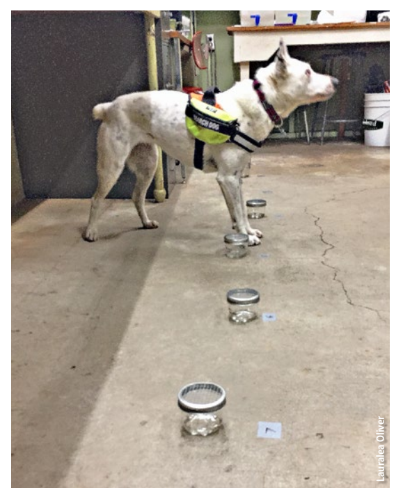
Detection dog displaying anticipatory, or alert, behavior at the one container that contained Phytophthora .

the dog-handler team was required to successfully indicate one target container randomly placed in a linear arrangement with seven control containers. The handler was unaware of the placement of the target container. The dog-handler team was required to successfully complete 10 consecutive target detection trials to move on to the next species and medium.