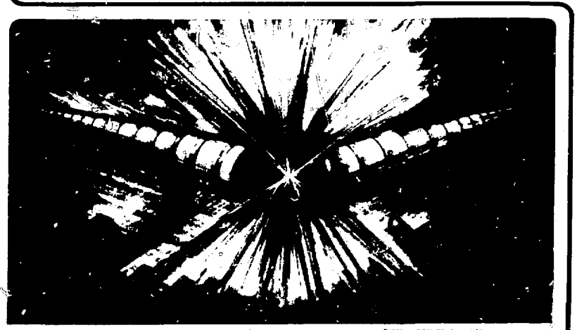
DETRIBUTION OF THIS DECUMENT IS DULINHING