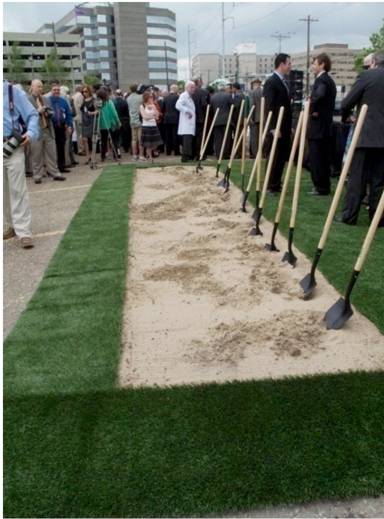
Figure 3 taken April 19, 2011

The posed nature of the first image becomes clear. They are not on newly broken land, but on a parking lot fitted with fake grass and sandbox sand. These are not the only key figures, but a series of key figures who each took their turn holding shovels and digging dirt. Though this is a celebration of the new hospital, those there can not say when the building will commence, as at the time of the photo most of the land had yet to be cleared, many of the buildings wrapped up in legal fights. The shovels, meant to demonstrate the work about to start, are props. Those holding the shovels will never actually work on the site. This scene took place at the end of the ceremony. At the beginning, before the speeches, began a woman gathered medical students and doctors herding them towards the front saying, “We want as many people with [white] coats on up front...if y’all can move up there.” The leaders prayed for “financing” and claimed they were “reinventing health care” and “laying the foundation for a robust biomedical corridor.” This new hospital would be a “symbol of resilience.” One speaker directed his comments towards a group who had been protesting the entire process (many