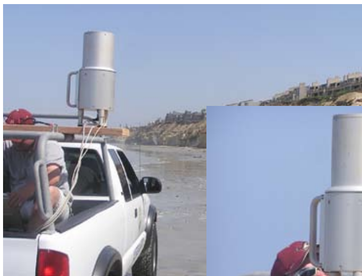
LIDAR scanning of a section of Solana Beach bluffs.