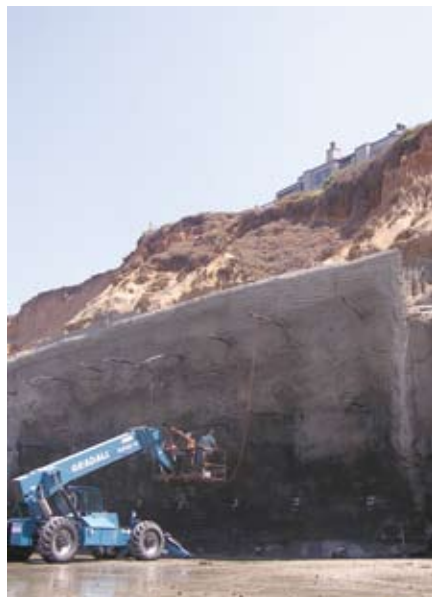
Building a bluff wall.

Recent Sea Grant research has shown that bluff erosion is a major source of beach sand in parts of San Diego County. An implication of this discovery is that coastal structures designed to prevent bluff retreat may reduce the supply of new beach sand to a greater degree than previously thought.