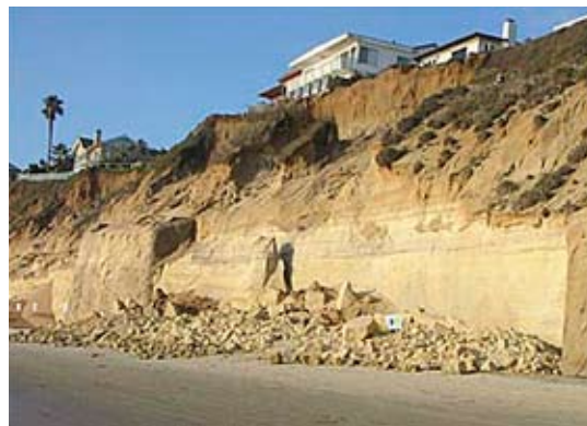
Crumbling Solana Beach cliffs.

If this were true, it would be yet more evidence suggesting the relative importance of coastal cliff