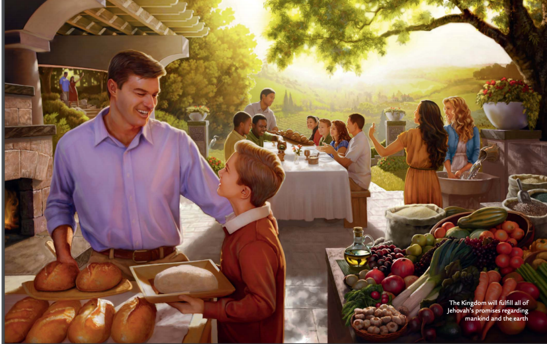
Figure 2. God's Kingdom Rules! 2014 Publication.