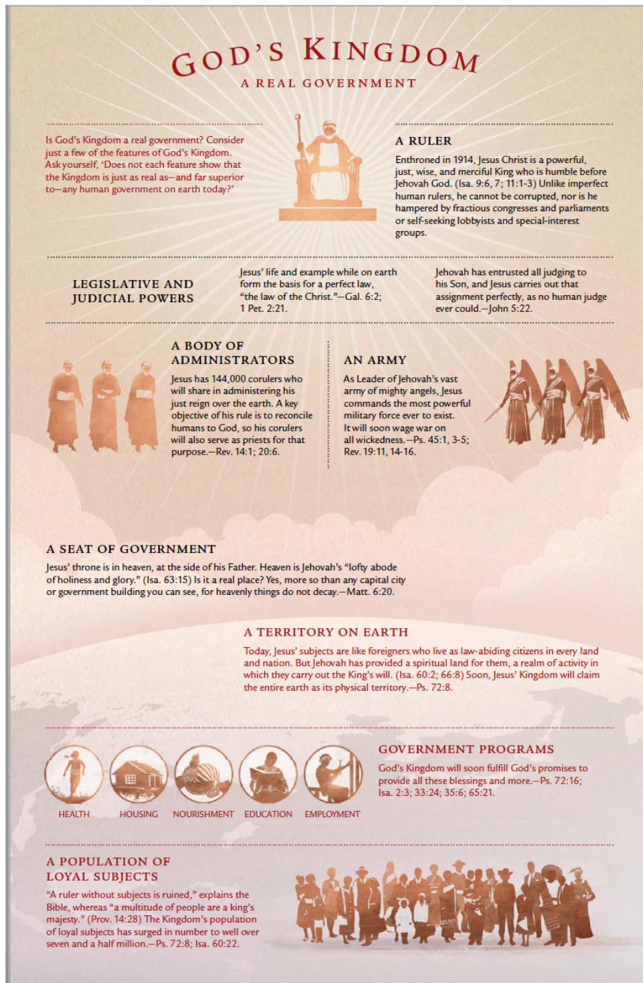
Figure 3. God's Kingdom Rules! 2014 Publication.