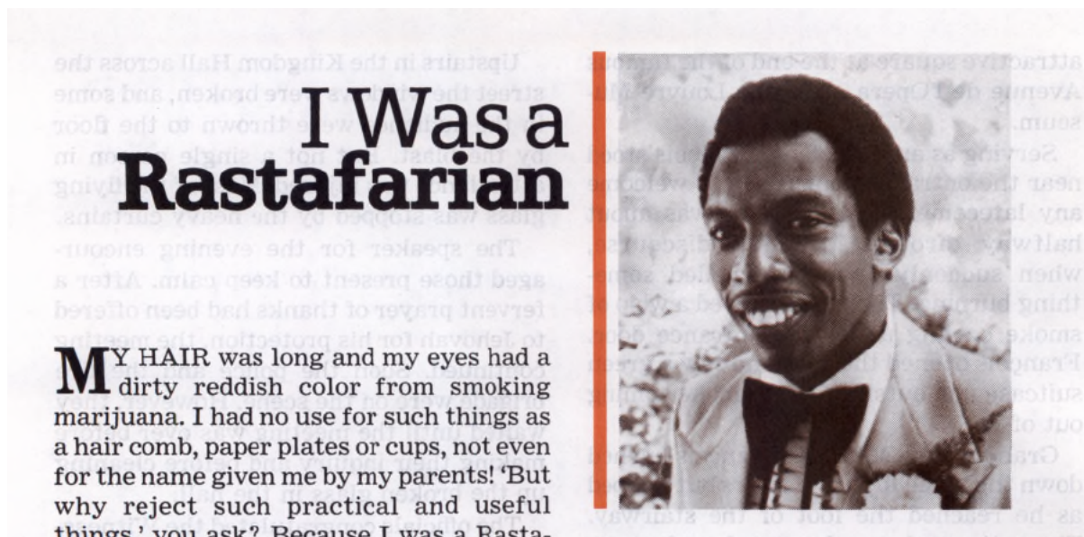
Figure 4. I Was a Rastafarian , in the AWAKE!—Feb 22, 1985 magazine.

Starting in 1985, the organization featured testimonials: accounts of how Black people became Witnesses. In addition, the organization utilized high quality images, in their brochures, to target African Americans as they aimed at appealing to Black’s people’s collective sensibilities. The combination of acknowledging racial difference while edifying and empowering Black women and men, act as a powerful peripheral cue to influence decision making.