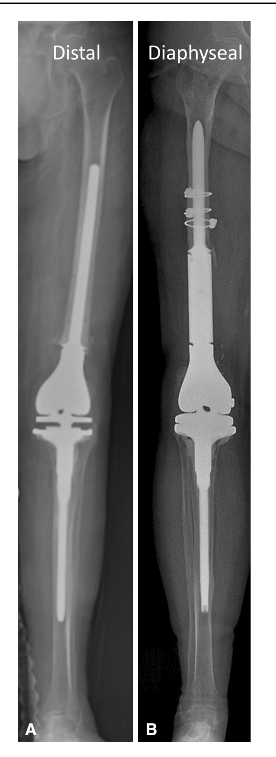
Fig. 1A–B Examples of the two lengths of endoprosthetic reconstruction studied for revision TKA with distal femoral bone loss are shown. A distal reconstruction extends from the knee to the supracondylar metaphyseal-diaphyseal junction ( A ) versus a diaphyseal reconstruction, which included cases from the supracondylar metaphyseal-diaphyseal junction to the proximal femoral diaphysis ( B ).

unsuccessful. Of the patients included for analysis, the mean length of followup was 4 years for distal reconstructions (range, 2–8 years) and 6 years for diaphyseal