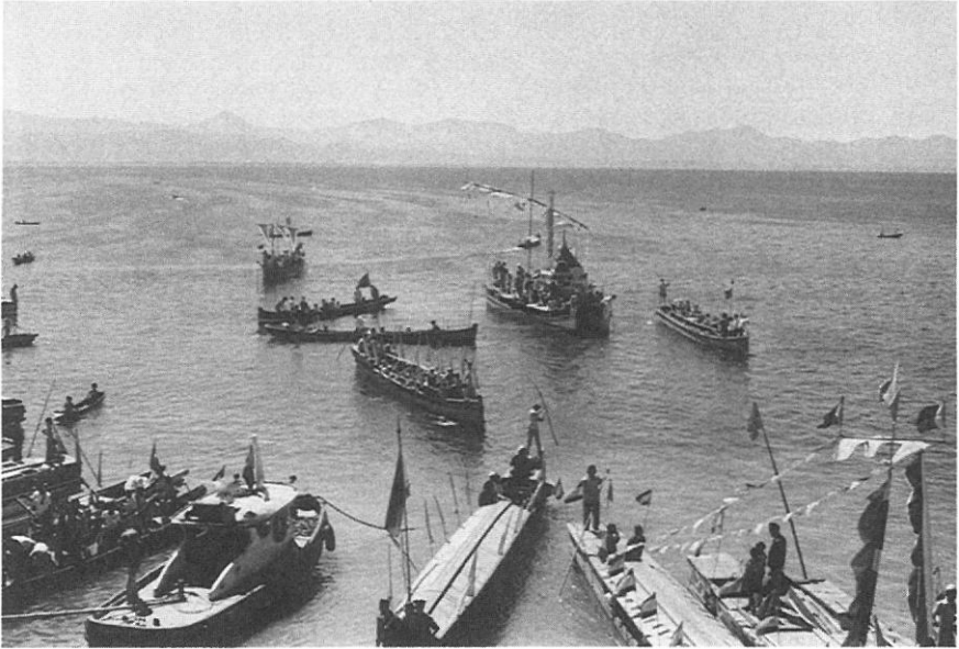
Figure 5. A Maranao fluvial parade in Lake Lanao. Large (motor)boats are sometimes tied together side by side to form a Gakit in which the Kolintang and the Tagongko ensembles are played while crossing the lake.