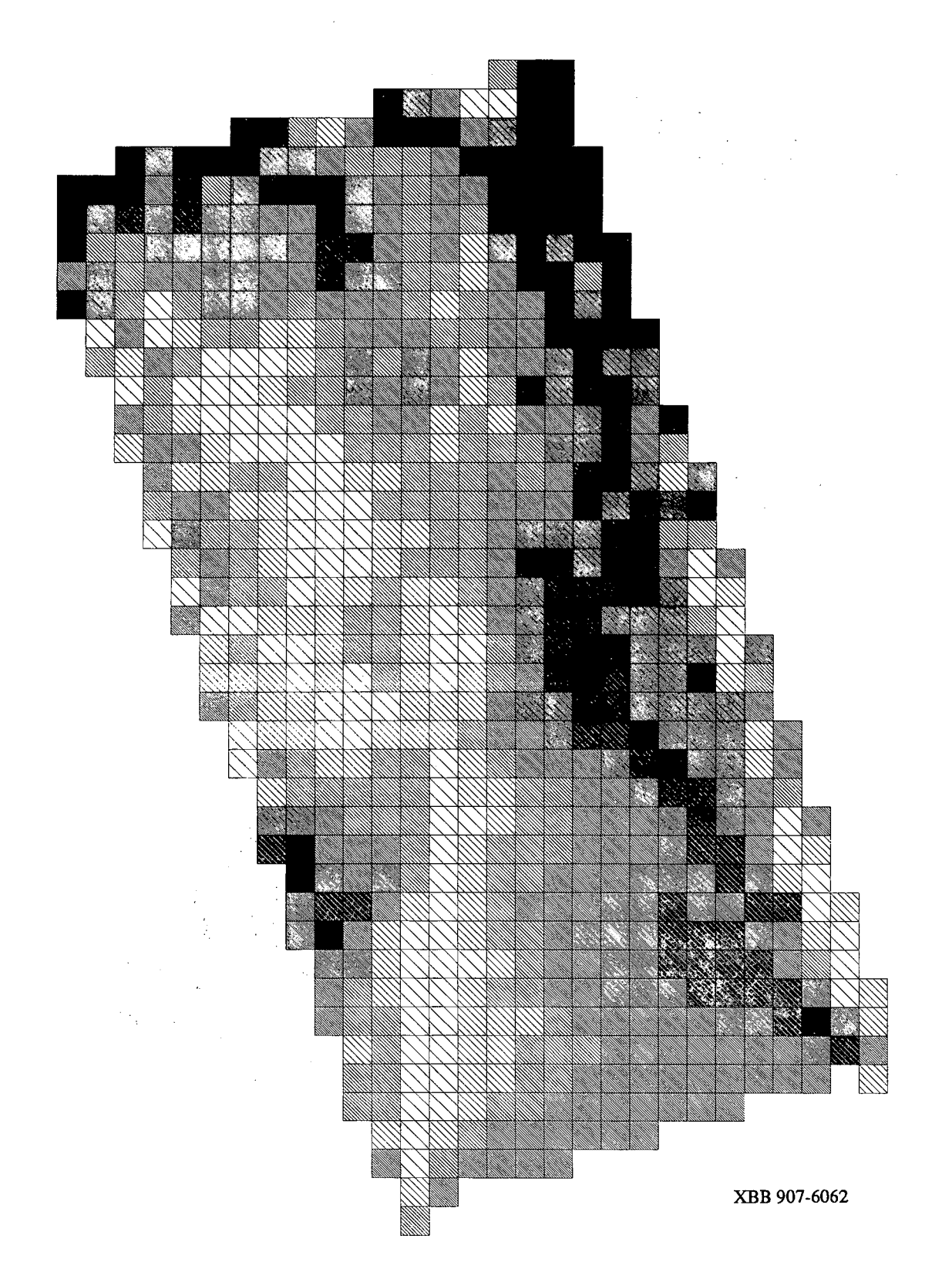
Figure 2.4. A tomogram of the Vp/Vs ratio's between US001 and US002, the interval is from 1.5 to 2.0 (light to dark).