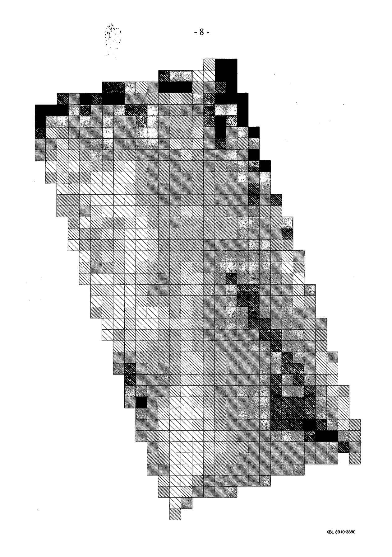
Figure 2.2. P-wave tomogram of area between US001 and US002, the velocity interval is 5.0 to 5.5 km/sec (light to dark).