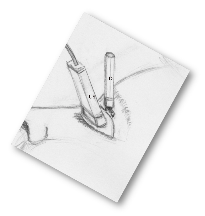
Figure 2. Graphic representation of the modified apparatus setup. The study subject is in a seated upright position, with a closed eyelid. The ultrasound transducer (US) is placed over the eyelid and the Diaton® transpalpebral tonometer (D) placed superior to the transducer.

that have investigated the potential adverse effects of ocular ultrasonography and its effect on IOP in human subjects.