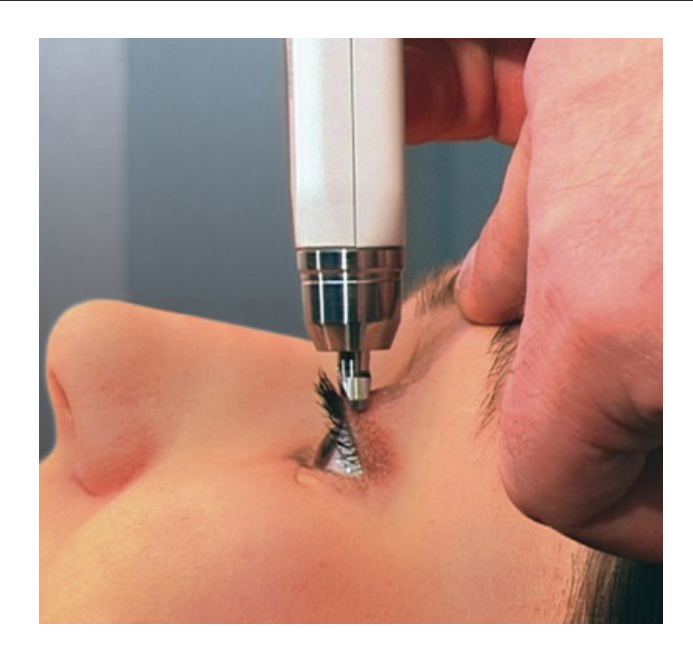
Figure 1. Diaton® transpalpebral tonometer. Photograph depicting the manufacturer's recommendation for placement of the tonometer on a partially open eyelid.

We calculated mean IOP values for each phase of measurement. "Pre-US" IOP values were 14.28mmHg (95% CI [13.26-15.29]). "Intra-US" IOP values were slightly greater than "pre-US" at 16.08mmHg (95% CI [14.92-17.23]). "Post-US" IOP values were 14.13mmHg (95% CI [13.14-15.11]). Comparing "pre-US" to "post-US" values, the difference of -0.15mmHg (range -3 to +3mmHg) and was not statistically significant (p=0.42). When comparing "pre-US" to "intra-US" IOP values, there was a statistically significant change of