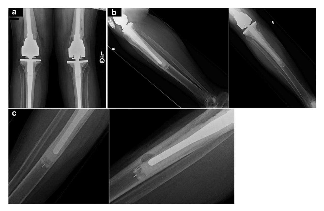
Figure 1. Five-year postoperative radiograph of revision right TKA. (a) Bilateral anteroposterior (AP) plain film of right and left hinged revision TKAs. (b) AP and lateral x-rays of the right tibia. (c) AP and lateral projections of distal stem tip in the right tibia. Mid-diaphyseal anterior tibial lesion can be seen at stem tip. Cement mantles other than the right tibial stem tip show no obvious erosions or debonding.

small (1-2 mm) fragments of necrotic bone and cement were found. All fragments were removed, and the bone was sent for culture. The remaining edges of the bone hole were debrided and curetted to a solid border. The defect was then filled with 5 cc of calcium sulfate/hydroxyapatite synthetic bone void filler (Cerament; BoneSupport AB, Lund, Sweden), which was injected into the region and spread flush with the anterior diaphyseal cortex (Fig. 2). A 14-hole 3.5-mm locking compression plate was placed centered over the defect to distribute bending stresses along the tibial diaphysis (Fig. 2). The tibialis anterior and soleus were then advanced over the plate and defect to provide a neovascular supply and additional soft-tissue coverage. The wound was closed in layers over a drain, and a soft compressive dressing was applied to the right lower extremity. The patient was made weight-bearing as tolerated, with oral doxycycline to