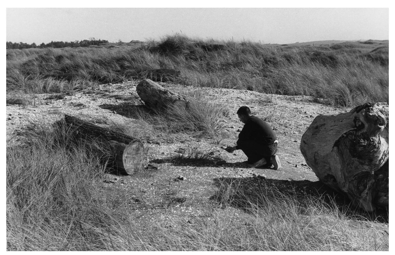
Figure 3. Sweetwater (CA-DNO-22). From Gould's 1964 site survey, courtesy of Richard A. Gould. Richard Gould Archives, California State Parks, Eureka, Cal., Image 333. Photo notes: "Historic Tolowa Indian smelting camp. Note surface erosion and poor preservation of site."

of a very large area used primarily for smelt fishing and shellfish collecting by many generations of Tolowa people. Both contain numerous loci containing mostly concentrations of shellfish, lithics, and/or fire-affected rock. Two areas between the sites each contain approximately 50 "clam" shell fragments (no other cultural materials were observed) that were recorded as isolates by Burns and Rhode (2009). Breaks between and within the sites can be attributed to a number of factors. For instance, the sites may have been used by many different families, who each set up their own discrete camp. The breaks may also relate to differences in site ownership-as described above, at least two villages laid claim to or owned sections of this beach, and ownership shifted over time. The patchy appearance of these sites has also been influenced by the dynamic nature of the sandy dune environment. Natural dune shifting continually exposes and conceals cultural resources, which has led to tremendous year to year variability in site visibility.