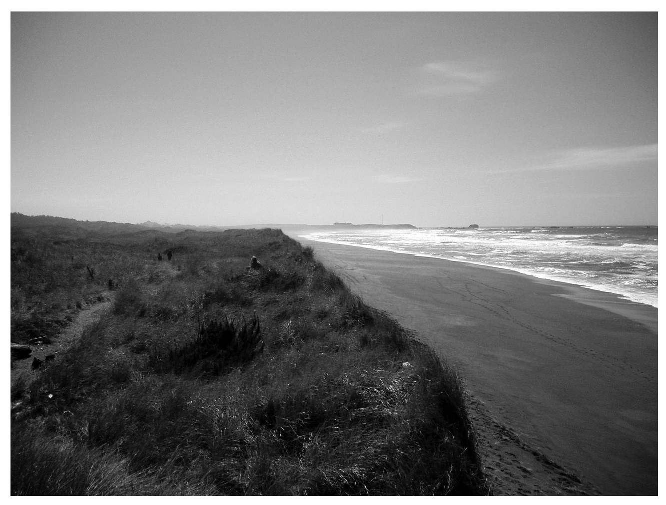
Figure 2. Sweetwater (CA-DNO-335). View to south. The rocky headlands of Point St. George are visible in the right background.

member and field participant Brock Richards as the Sweetwater site (Tushingham 2006:26). A midden area and adjacent circular depression, most likely associated with a semi-subterranean house, is located within the site just north of Sweetwater Creek (Burns and Rhode 2009). If the depression is indeed a house, it may be one of the "several houses and a sweat house" at Sweetwater mentioned by Drucker (1937). This seems quite possible, as this is the only archaeological site in this section of the coast where midden has been recorded, and it is also the only ethnographic camp with houses, according to Drucker (1937).