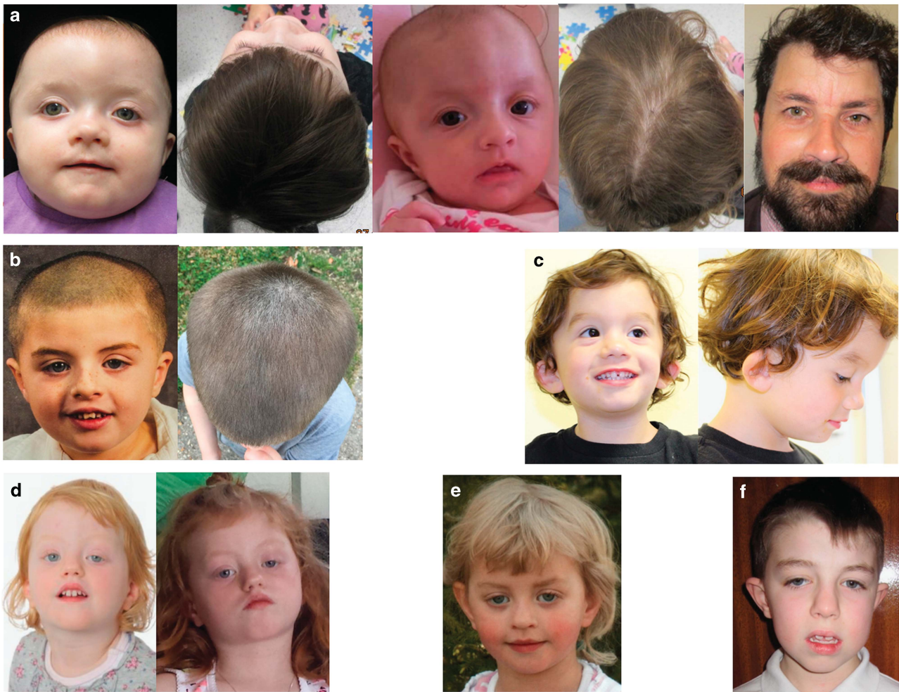
Figure 2 Facial photographs of subjects with ZNF462 variants. (a) From left to right: proband (6 months), a bird's eye view of her head, sister (1 month) with a bird's eye view of her head and the father from family 1. (b) Proband from family 2 at the age of 2 years. (c) Proband from family 3 at the age of 2 years. (d) Proband from family 4 at the age of 3 and 5 years. (e) Proband from family 5 at the age of 4 years. (f) Proband from family 6 at 7 years. Note: more recent photos showing more significant ptosis in both sisters from family 1 were not approved for publication by the family.

philtrum. At the age of 5 years, she attended kindergarten and there was no concern about her development.