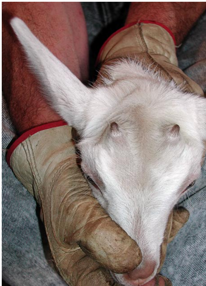
This kid's horn buds are too large and should have been removed sooner with a disbudding iron to avoid scurs (horn regrowth).

Disbudding, depending on goat breed and gender, could be needed as early as a few days of age, or whenever you can clearly feel the horn buds. Hair growth over the horn bud should be palpated (i.e., felt by hand) so you can avoid trying to disbud a naturally polled (i.e., hornless—which is generally rare) kid. The hair on the horn bud will grow in a swirl over the horn bud, whereas the hair on a polled kid will grow flat over the horn area. Most importantly, you will need an effective way to restrain the kid during the process. Remember, you are working with a hot iron and any movement by the kid will create a greater hazard to you, the kid, and anyone else who is helping you. The common restraint tool is a kid disbudding box, available through livestock supply catalogs. This box completely encloses the kid, with the exception of the head, and allows one person to do the disbudding unassisted. Several brands of electric iron are available through most supply catalogs and their effectiveness does not vary to any great extent, although a hotter iron may be more desirable as it reduces disbudding time. Most sources recommend an iron with a \frac{3}{4} - to 1-inch diameter tip. Shaving the horn bud before you start will provide you with a better view of what you are doing and will also lessen the smell from burnt hair.