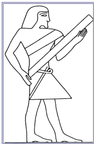
Figure 1. A priest holding an unrolled papyrus scroll.