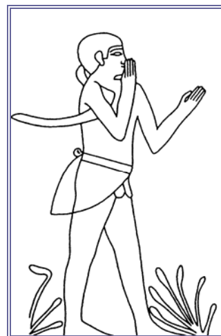
Figure 3. Gesture for a call.

speaker with a gesture of recitation. In tombs from the 5 th - 11 th Dynasty, the lecture priest holds the unrolled papyrus scroll (fig. 1). Sometimes the tomb owner is represented as the speaker. He is depicted as a man with one arm lifted up in invocation like the determinative A 26 in Gardiner's sign list (fig. 2). The hand held to the mouth (fig. 3) is a gesture of a call (Dominicus 1994: 129). When the speaker is introduced in the form of a picture or the first person pronoun, it is