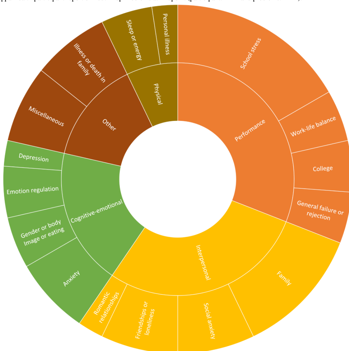
Figure 3. Appa Health participant report of Youth Top Problems at midpoint (participant: n=14 and problems: n=42).