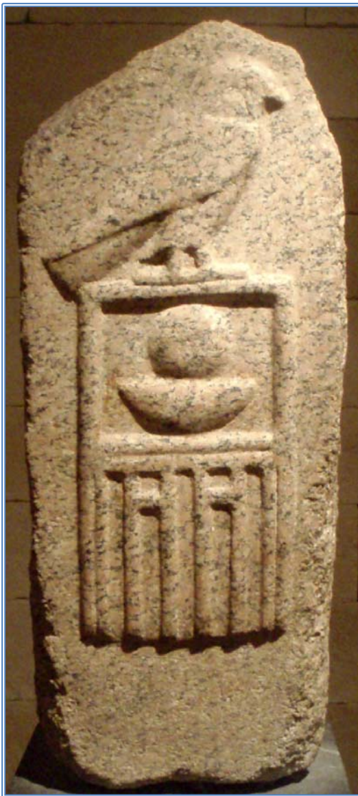
Figure 1. Stela of Raneb, Metropolitan Museum of Art, New York.

The broad historical outline of the 2nd-3rd dynasties has been established with some certainty (Wilkinson 1999: 82-105; Kahl 2006; Seidlmayer 2006). The 2nd Dynasty (c. 2800 – 2670 BCE) began with a line of three kings buried at Saqqara—Hetepsekhemwy, Raneb, and Ninetjer—who are attested predominantly from sites in the Memphite region (fig. 1). At