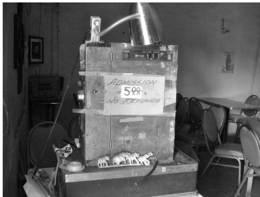
Figure 10: The cash register at Lerma's.

Another artist I spoke with told me he won't even take gigs at the Royal Palace because they don't pay enough. According to him conjuntos only make $200 for the afternoon, and he wants something in the area of $300-$350. Even more when he plays out of town, but they'll pay it. When he does play at Royal Palace for a Sunday afternoon tardeada in the middle of August's canícula , the hottest part of the summer, the place is packed. In my notes I remark that I have never seen it so full. Reportedly, he's pulling $600 for playing this particular day.