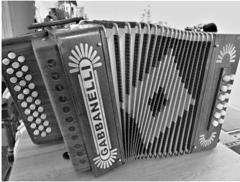
Figure 13: Eva Ybarra's beautifully maintained, vintage Gabbanelli 100 accordion, at her home in San Antonio.

machihembriado sound (256). While compelling in and of itself, Hutchinson's work prompts several questions by comparison to gendered dynamics in the conjunto genre.