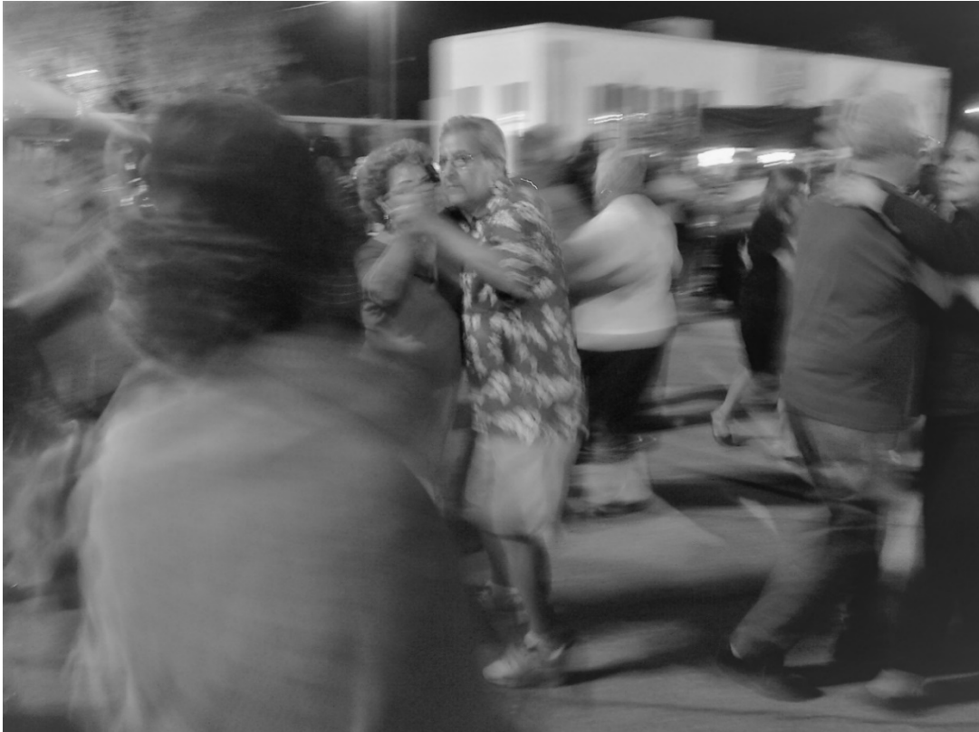
Figure 7: A couple appears to pause as dancers spin around them at the at the 20th Annual Narciso Martínez Conjunto Festival in San Benito, Texas, in October, 2011.

based ‘ethnic’ music meant that labels could and did repackage, relabel, and rename albums in order to sell to diverse markets. One salient example is that of Narciso Martínez, the first true ‘star’ of conjunto, whose Depression-era recordings for the Bluebird label were attributed to “Louisiana Pete” and “Polski Kwartet,” and marketed to the Cajun and Polish-American listening communities, respectively—with no mention of Martínez’ authorship (Strachwitz, 1977). This sort of cross-cultural exchange still continues today, albeit under the artists’ control, as evidenced by the Two Kings of Accordion tour and eponymous recording featuring conjunto artist Santiago Jiménez, Jr. and Chris Rybak, the ‘Accordion Cowboy’, a second-generation self-taught accordionist playing music inspired by his Czech heritage. 76