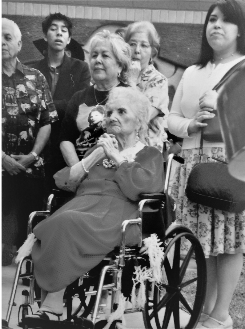
Figure 5: A rare public appearance by Lydia Mendoza, at the opening of the Tejas Music Museum in San Antonio, May 5, 2005.