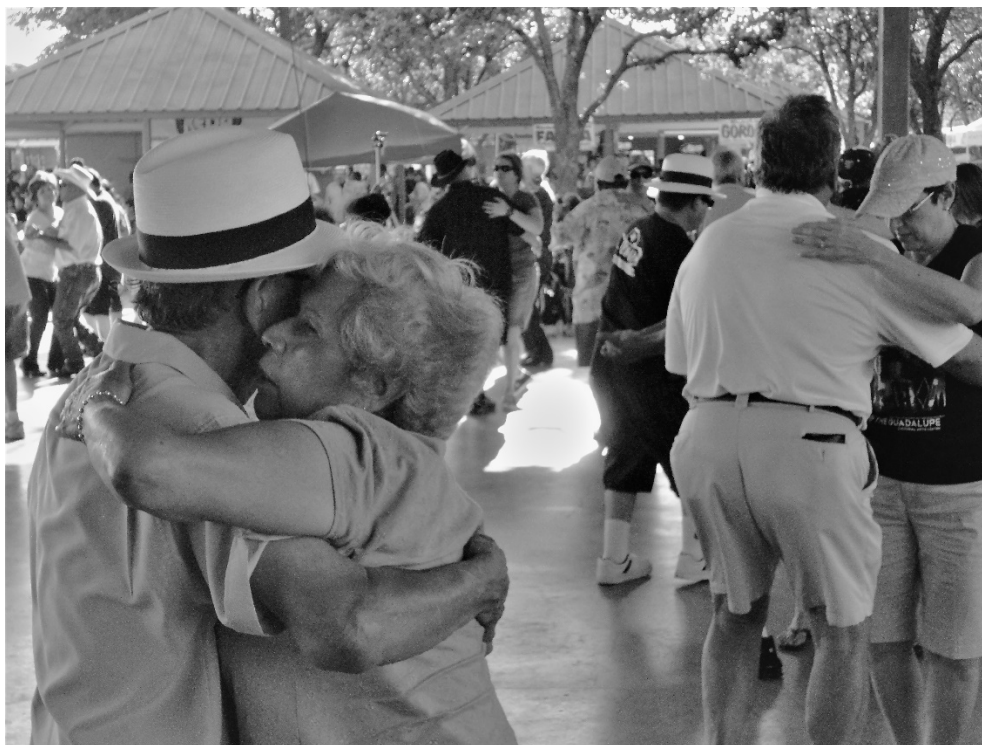
Figure 1: Couples dance at the 2012 Tejano Conjunto Festival en San Antonio.

As a form of cultural studies, I view conjunto music and its attendant social scene as more than an outlet for recreational entertainment since its participants belong to a larger social world in which their lives—and their bodies—are gendered, racialized and marked as laborers. While the salón de baile or conjunto night club may be a temporary sanctuary or refugee from society’s confines, I argue that conjunto’s listeners, dancers, and performers negotiate power and privilege through forms of verbal and non-verbal forms of communication, such as sung lyrics or bodily movements, grounded in their material reality. Dance halls, beer joints, and ballrooms where conjunto is listened to, performed, played and enjoyed inform a relationship between public space, personal memory and collective history, creating what Dolores Hayden terms “the power of place”— “the power of ordinary urban landscapes to nurture citizens’ public memory, to encompass shared time in the form of shared territory” (1995:9). Dancing gives us insight into ways in which gendered negotiations of power, expressions of desire, and constructions of identity are performed—in front of the stage, on the floor, one song at a time, “day after day and night after night” (Delgado and Muñoz, 9). 6