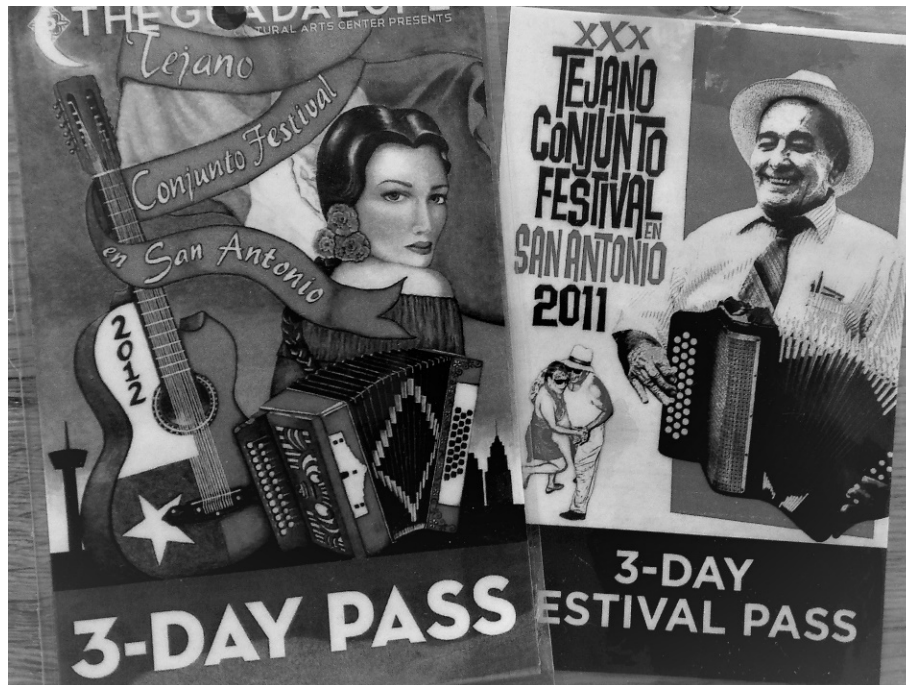
Figure 3: 2011 and 2012 Tejano Conjunto Festival 3-Day Passes, featuring the winning poster design. From the author’s collection.

A staple of the Tejano Conjunto Festival is the poster competition. For almost every year of the festival’s existence there has been an open competition to select the poster design that will advertise that year’s festival. The winning entry, along with the runners up and entries in different age categories, are all displayed at the Fest. On the second day of the 2012 festival while I spend some time admiring the range of entries a man came up behind me to share his (unsolicited) opinions. “I like this one, I like this one, but I wish they went with this one,” he said, pointing at the winning entry and two runners up.