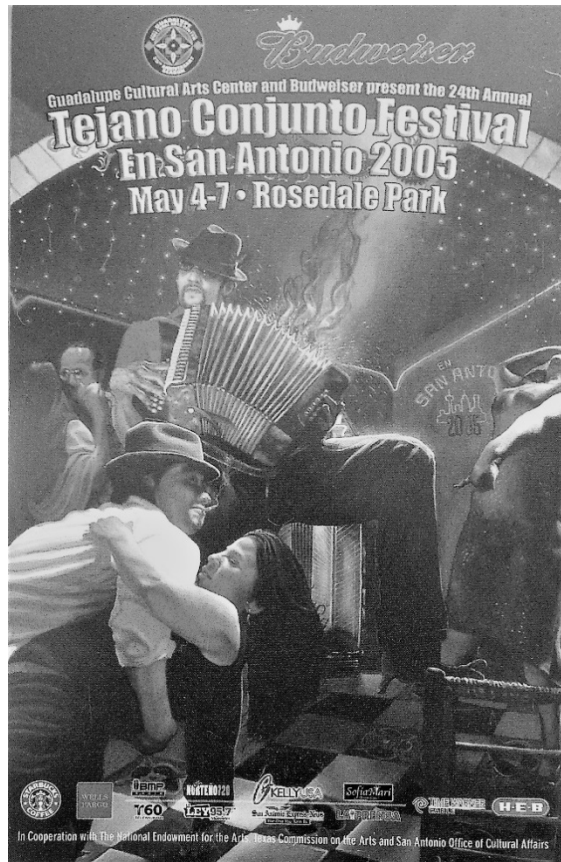
Figure 11: Promotional postcard advertising the 2005 Tejano Conjunto Festival, by Vincent Valdez. Note the sponsor sharing top billing with the Guadalupe Cultural Arts Center.

foresight and agency on Gonzales' part. She prepared for career options as alternatives to performing. More importantly, however, it reveals that even the most successful and prominent of Tejano musicians struggled to make a sustainable, viable long-term career out of performing. And, to extrapolate further, if this was indeed a struggle for her then what of the scores of other Tejano and conjunto musicians, male and female, who didn't achieve nearly the same level of fame?