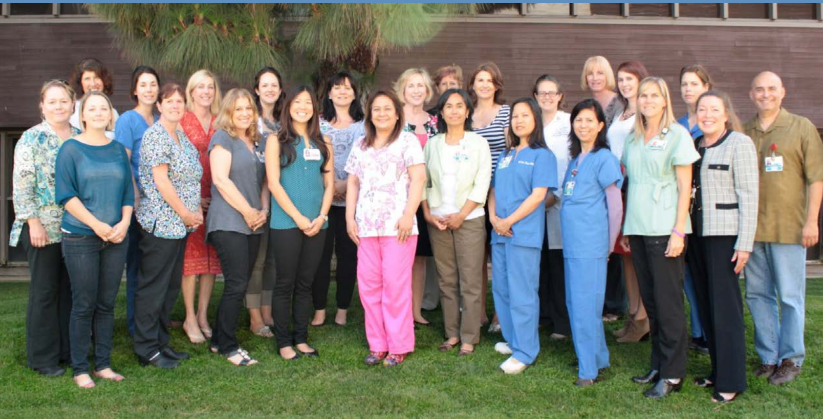
Shared Governance Nursing Cabinet

Nurses making decisions about clinical practice standards, quality improvement, professional development, and nursing research