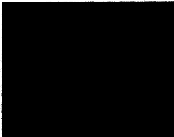
FIG. 2. Scanning electron micrograph (SEM) for a thin section near the center of the Gerardia trunk. Distance scale of 100 \mu\text{m} is shown in bottom right corner.

This age estimate is based on three assumptions: (1) The source of carbon to Gerardia is surface-derived POC from the western North Atlantic, and its pre-bomb \Delta^{14}\text{C} signature ( -76\% ) remained constant over its lifetime; (2) Its skeleton remained unaltered and there was no exchange with other carbon sources or selective remineralization that would cause