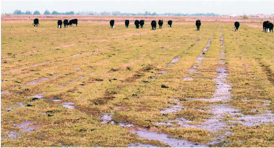
Cattle graze on a bermudagrass pasture grown on saline soils in Kings County; the fast-growing grass could also be harvested as a biomass feedstock if suitable markets were available nearby.

in dry years, potentially limiting production levels in biorefineries using it as a feedstock. In contrast, the production of a salt-tolerant perennial grass in California using moderately saline water for irrigation could provide reliable, predictable supplies of biomass to a factory sited near the point of production. If yields are high, the distance biomass must be moved would be reduced because the area needed to produce it would be smaller and biorefineries could be centrally located.