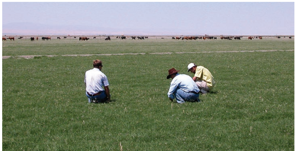
Some biofuel crops may help remediate environmental problems. UC researchers and a grower evaluate bermudagrass pastures in Kings County that were produced on saline soils and irrigated primarily with recycled, saline drainage water.

Standards for energy crops must be based on a clear definition of sustainable agriculture. Hansen (1996) provided a still-useful categorization of differing definitions, arguing for (1) a literal definition of sustainability — the ability to continue over time, (2) the quantitative assessment of properties associated with sustain-