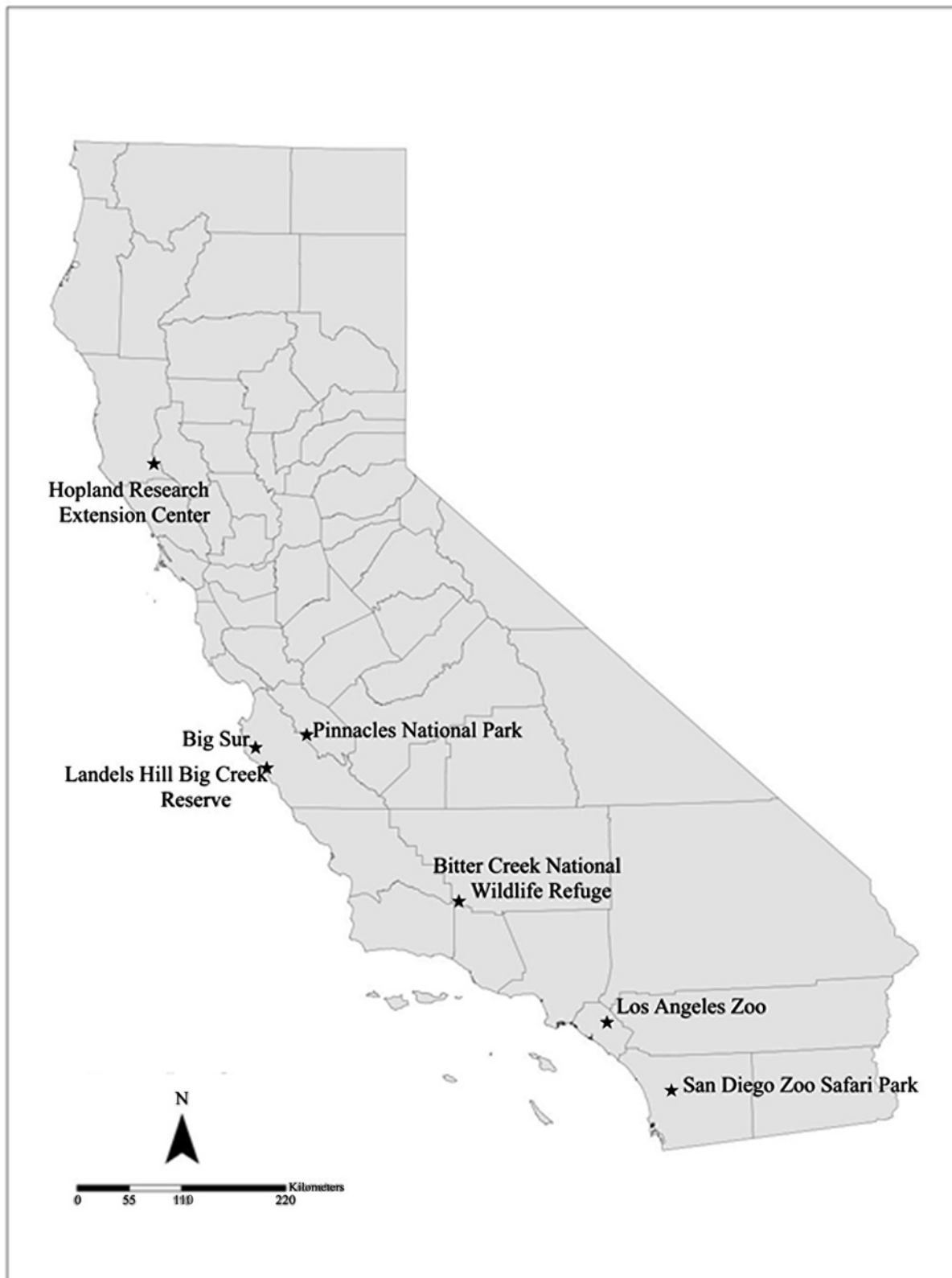
Fig 1. Sampling sites of California condors, golden eagles and turkey vultures in California. Sampling sites designated by black stars.