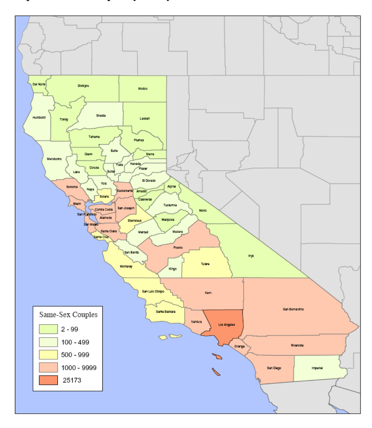
Map 1: Same-sex couples by county in California