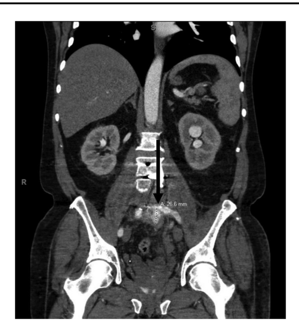
Image 2. Coronal computed tomography slide with marker indicating 26.6-millimeter left common femoral artery mycotic pseudoaneurysm.

The patient was taken to the operating room with vascular surgery where he underwent placement of a left common iliac artery stent as well as left femoral artery cutdown and repair. Computed tomography of the abdomen and pelvis with rectal contrast showed no evidence of fistulous connection to the rectosigmoid wall. Definitive repair was completed four days later with right common femoral artery to left superficial femoral artery bypass, IVC filter placement, sartorius myoplasty, and left common iliac artery embolization.