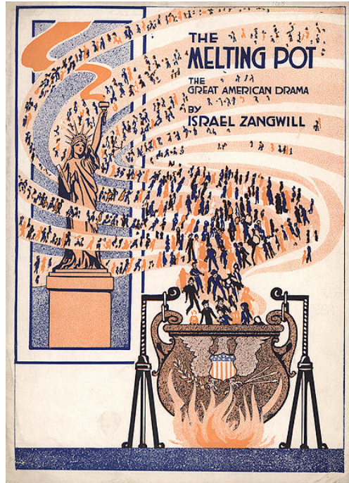
Cover of the theater program for a 1916 production 58