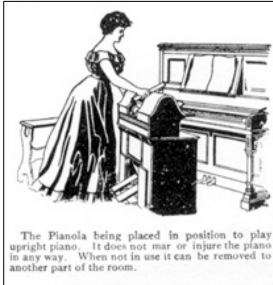
An early push-up model 92

Later models were enclosed within the piano case, sometimes requiring an operator to pump the bellows, sometimes requiring simply the push of a button to begin the musical entertainment. By about 1907, player pianos had developed more extensive controls for tempo, phrasing, dynamics, and pedal effects to replicate “the full virtuosity of the artist – the nuances, the phrasing, and all the shadings.” 93