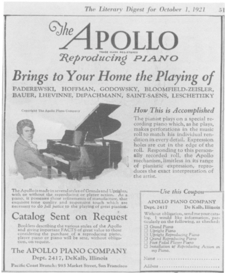
Apollo Reproducing Piano Ad 98

Now mentally replace this “European genius” with “classic” ragtime composers Scott Joplin, Jelly Roll Morton, or Eubie Blake. Suddenly, a racialized specter has entered the middle class white American home, delighting the family with the latest ragtime tunes. In none of the advertisements that I have examined are African American musician/composers portrayed or even named, but their spectral presence is imaginable given this popular marketing technique. If Beethoven is a ghost at the player piano, however, then an African American ragtime composer like Scott Joplin is rendered doubly spectral, diminished almost to the point of derealization.