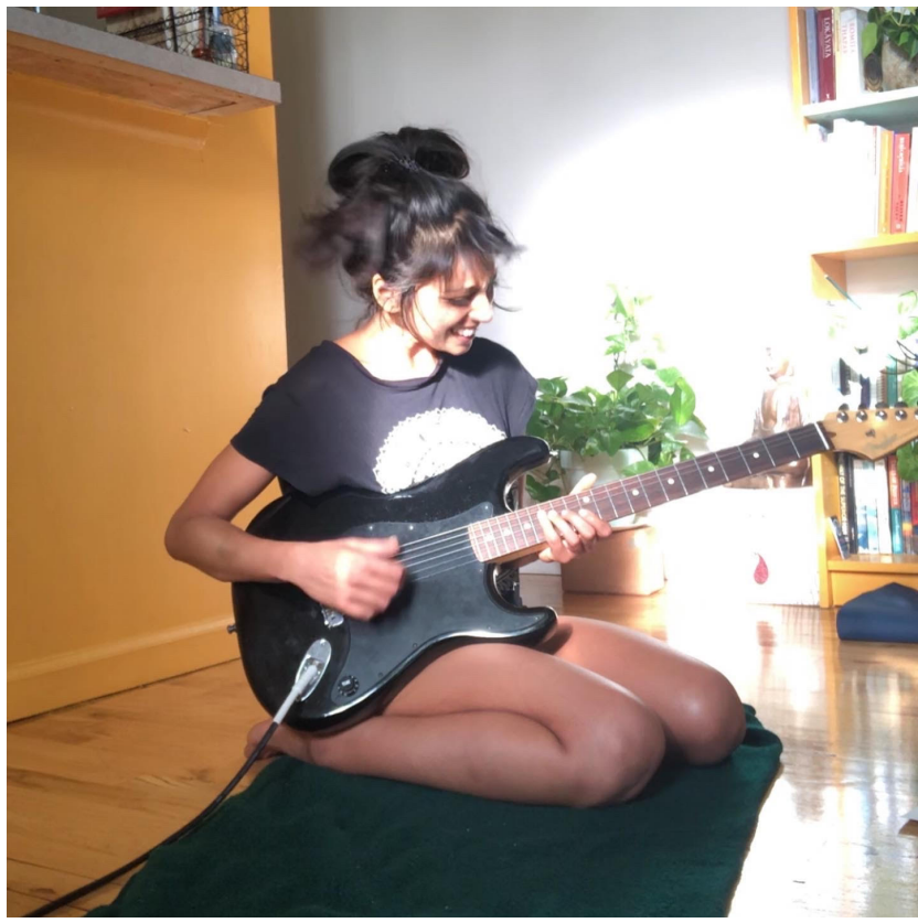
Figure 1 - Sitting in Virasana and Playing Prince at Home in New York City.

It was an innocent confidence. Weeks passed before I realized that my ears were more awkward than my hands. I was using an electric tuner, relying on my eyes to read the screen, because my ears had no idea if my tunings were a little high or a little low or what the difference between high and low even sounded like. My dance training instilled rhythm into my very core, but melody and tonality had been lost on me.