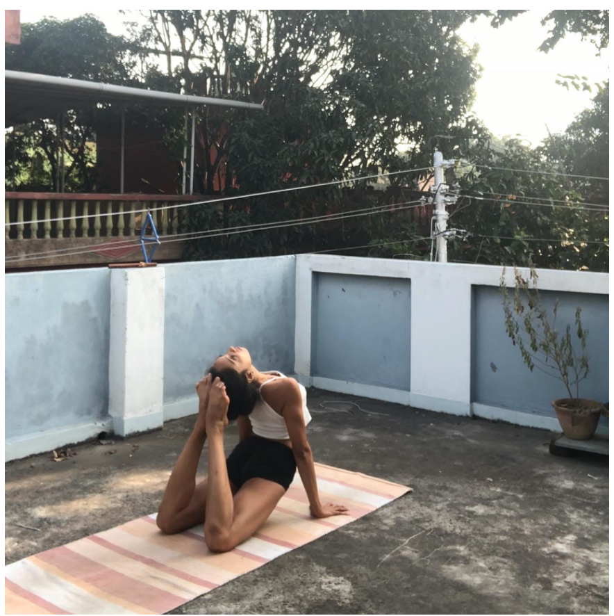
Figure 2 - Practicing Backbends on my Uncle's Rooftop in Kolkata, India (Photo Credit: Megna Paula).

Then I would listen to Prince for hours at a stretch, enmeshed in the act of hearing, an ecstatic rapture equal to tripping on mushrooms, but soberly. The songs I "heard" a million times were awash with newness. I could suddenly untangle the interplay of instruments: bass from rhythm guitar, patterns in the drumlines, the way the lyrics came through the intricate melody, the occasional lilt of first guitar that was so iconically Prince, inspired and irreverent, skilled on a level that I was beginning to realize in my body-mind, on my mat.