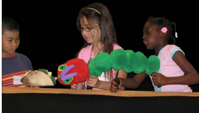
7: Freese Kindergarteners learning to perform Eric Carle's "Very Hungry Caterpillar"

In some of the arts classes, English and Spanish were used side by side. In one kindergarten music class, the teaching artist began by singing "La Sorpresa", then drew pictures on chart paper, as he explained, in English, what happened in the song. That way, whether the