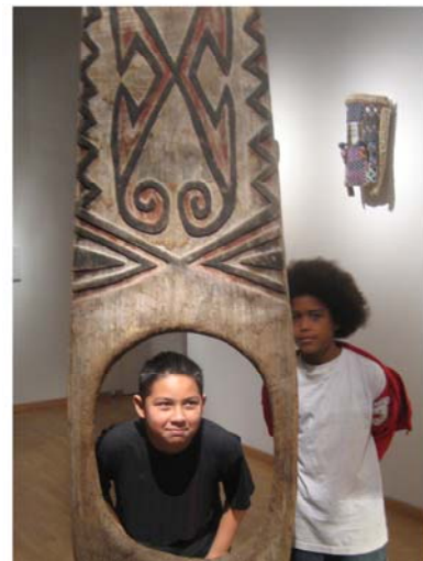
12: Freese students at Mingei International Museum.

Since the teachers at Freese were not trained arts specialists, the arts lessons were delivered by teaching artists from the community. The teaching artists collaborated with classroom teachers to plan arts lessons that linked to lessons in other content areas. At the time that the magnet program was getting started, the San Diego school district was focusing strongly on raising test scores. Schools were discouraged from taking field trips. Freese, with its arts and culture magnet program, was one of the few San Diego schools able to actively partner with arts organizations. This gave rise to many opportunities to collaborate with organizations such as the San Diego State Theatre Department, the San Diego Guild of