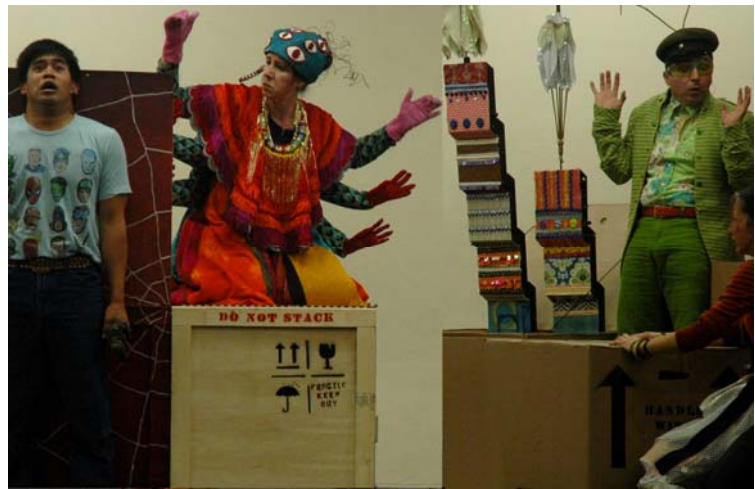
3: La Jolla Playhouse Student Pop Tour performing at Freese Elementary in San Diego, California.

This article looks at a cultural arts magnet school that has focused steadily on imparting such intellective competencies to students living in a diverse community only 20 minutes by car from the United States-Mexico border. Located in the southeastern corner of the San Diego Unified School District, Freese Elementary was not only the first school to implement the Mapping the Beat curriculum after it was funded by a grant from National Geographic, but it has continued to pursue arts integration across all grade levels through its Cultural Arts Magnet Program, building a vibrant school culture in a turbulent neighborhood.