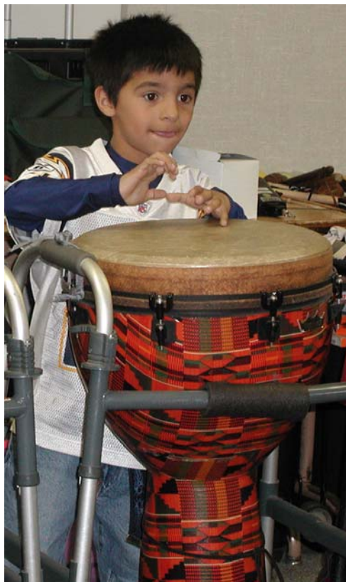
1: Second grade student at Freese Elementary, learning drumming and percussion.

The U.S.-Mexico Border Region, as defined by the 1983 La Paz Agreement, is the area within 100 kilometers (about 62.5 miles) on either side of the international border. Extending 1,952 miles, from the Gulf of Mexico to the Pacific Ocean, this region has in recent years been subject to explosive population growth (from 6.9 million in 1980 to 13 million in 2005). News reports focusing on this area have tended to emphasize the political and environmental challenges associated with rapid demographic and economic change. However, there are success stories as well. This article focuses on Freese Elementary School, where the Mapping the Beat lessons sponsored by National Geographic were first implemented. This is a school that has used the arts to create many bridges among ethnic groups in a volatile corner of San Diego.