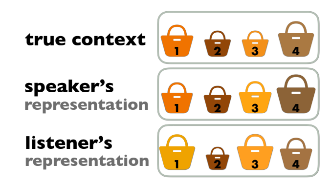
Figure 1: Illustration of subjective agent representations.

In words, a string like "big brown bag" characterizes the set of all bags in context C that count as brown (in the set of bags in C) and that count as big (in the set of bags that count as brown in the set of bags in C). Each adjective is therefore interpreted relative to its local context of incremental compositional semantic interpretation, so to speak. The effect is that adjectives closer to the noun will operate over a larger context (i.e., one that is less restricted); paired with a context-dependent semantics as in (3), it is conceivable that the ordering of adjectives matters for referential success.