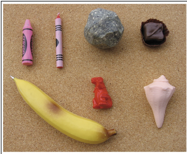
Figure 1. Sample deceptive objects used in AR and flexible-naming tests. Top row: sample deceptive objects used in AR tests. Left to right: crayon eraser, crayon candle, rubber rock, candy magnet. Bottom row: nondeceptive representational objects used in flexible-naming tests. Left to right: banana pen, crayon dinosaur, seashell soap. Deceptiveness (i.e. good fakes versus obvious toys) does not influence children's AR performance [5].

theory-of-mind errors. However, before detailing this argument, we must examine the popular assumption that children's AR errors, and related errors about the real and unreal, come from representational inflexibility.