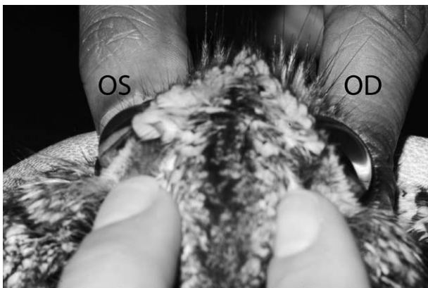
Figure 2. The dorsal aspect of the head of the same owl as shown in Figure 1. The intraocular pressure was 37 mm Hg in the left eye (OS) and 11 mm Hg in the right eye (OD). Note the shallow anterior chamber OS relative to OD caused by anterior displacement of the lens-iris diaphragm believed to have resulted from aqueous misdirection.

(OD) but absent OS. Menace response and dazzle reflex were absent OU, as is not uncommon in normally sighted raptors. Palpebral reflexes were complete OU. Examination OS revealed normal upper, lower, and third eyelids; marked conjunctival and episcleral hyperemia; adequate precorneal tear film; and a clear cornea. The anterior chamber was formed but very shallow because of forward displacement of the iris and lens. This displacement was more marked dorsally where the iris billowed forward more prominently at the collarette region than at the iris root or pupillary margin (Figs 1 and 2). There was moderate rubeosis iridis but no posterior synechia were seen.