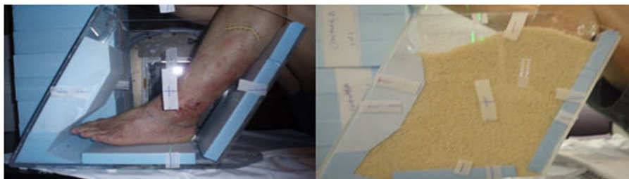
FIGURE 2 | Clinical setup for patient B.