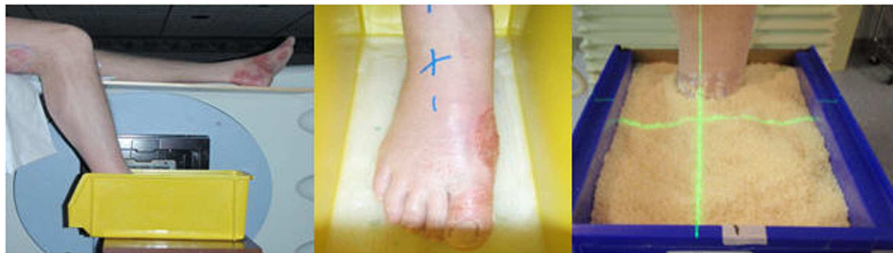
FIGURE 1 | Clinical setup for patient A.

MF, mycosis fungoides; ALCL, anaplastic large cell lymphoma; RT, radiotherapy; CT, chemotherapy; Gy/fx, Gray per fraction; MTX, methotrexate.