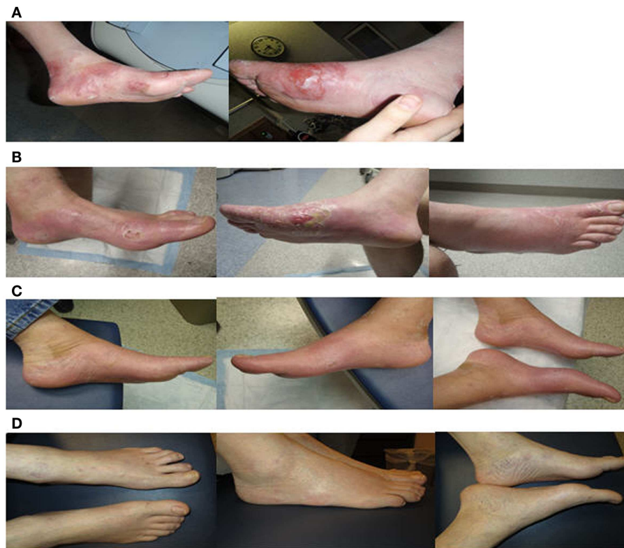
FIGURE 5 | A series of clinical photographs of patient A before treatment (A), immediately after treatment (B), 2 months after treatment (C), and 12 months after treatment (D).

patient passed away <22 months after treatment completion from progressive systemic disease. The two other patients remain on systemic therapy.